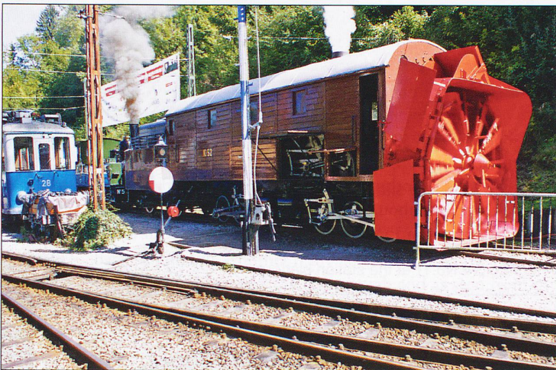
RhB No.9214 Xrotd 6/6 rotary snow plough, with the plough rotating, hence the railing in front.

others, I found that due to French air traffic controllers playing their usual games many flights were cancelled. I was pleasantly surprised that Easyjet offered me a one night stay in a four-star city centre hotel, a dining voucher for the hotel, and a 24-hour Geneva local transport pass. As I had no commitments the following day I re-booked on a late flight back to Gatwick and spent a pleasant few hours sampling the impressive Genève tram network. I was delighted to see trams on Line 18 showing their destination as "CERN" – a tramcar to the Large Hadron Collider, splendid! 🇨🇭