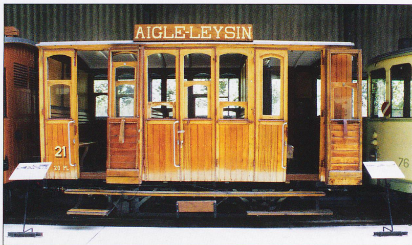
Aigle – Leysin carriage 21 inside the museum.

Returning to Genève on Tuesday, along with thousands of