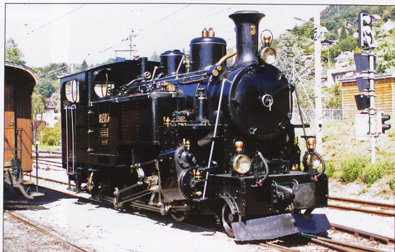
BFD3 at Blonay running around the shuttle train to the museum.

For me the highlights included: seeing the two Furka locos