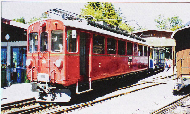
RhB No.35 (BB10).