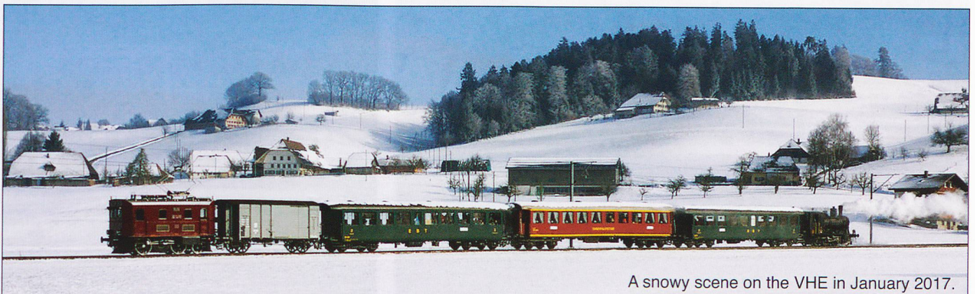
A snowy scene on the VHE in January 2017.