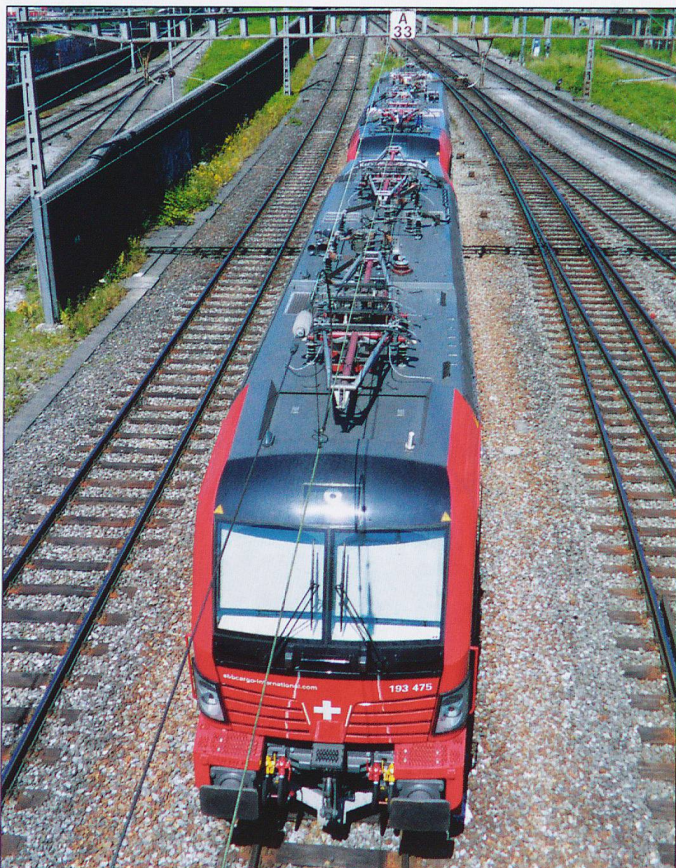
SBB CI Vectron MS showing the pantographs at MuttENZ - June 2018.

Delving into the press release information offered by Siemens Mobility, the Division of the German conglomerate responsible for its design and manufacture, it is clear a modular construction methodology has been adopted from the outset, so not only can units be delivered to meet the wide variety of immediate needs of purchasers, but they can also be 'easily' (a relative term I detect!) retrofitted or converted as changing customer needs arise. Unlike areas of the world such as the United States of America where the Federal Railroad Authority sets Nationwide 'standards' and manufacturers can adopt a 'one-size-fits-all', when it comes to the 'United States of Europe' the situation is considerably different. Despite the continuing efforts of the European Union, there is still and will be for a considerable number of years (or lifetimes?) to come, an enormous diversity of railway infrastructure, gauges, signalling, safety systems and so forth, grown up from the advent of railways in the 19thC. Thus the need for the modular approach in locomotive design to be able to meet customer demands of fast delivery with full