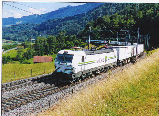
TOP: BLS Cargo No.409 Vectron at Spiez - June 2018. BOTTOM: railCare Vectron No.476 455 on a freight at Immensee - June 2018.

even those working to 1:1 scale haven't standardised!