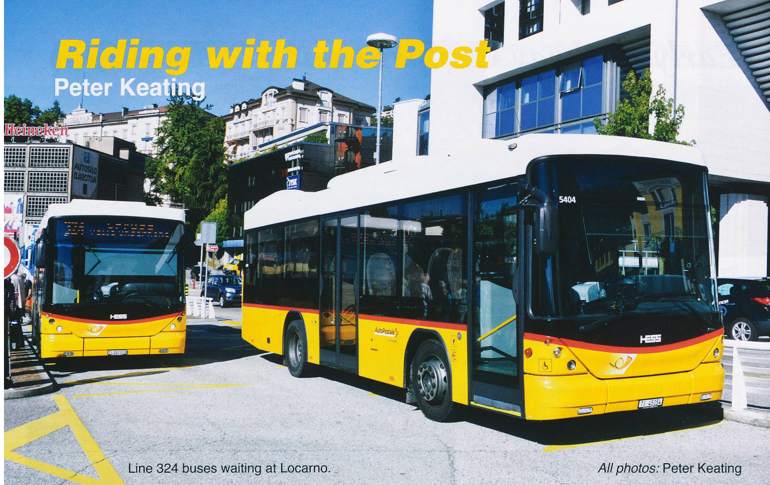
Line 324 buses waiting at Locarno.