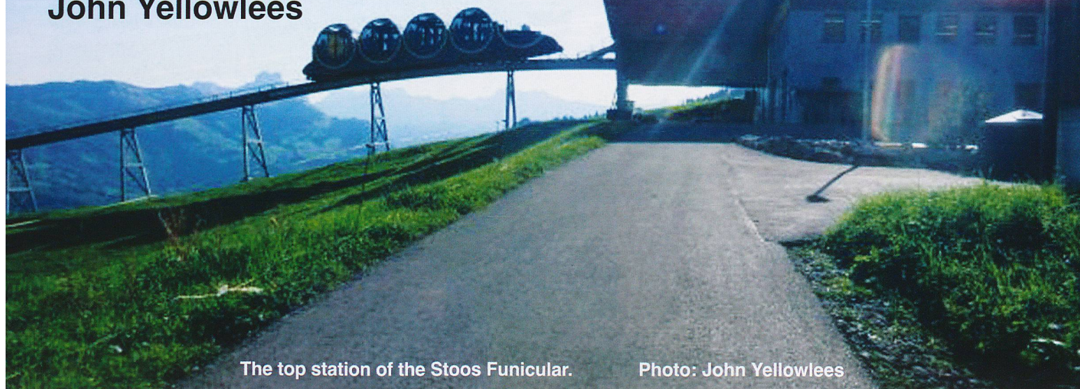
The top station of the Stoos Funicular.