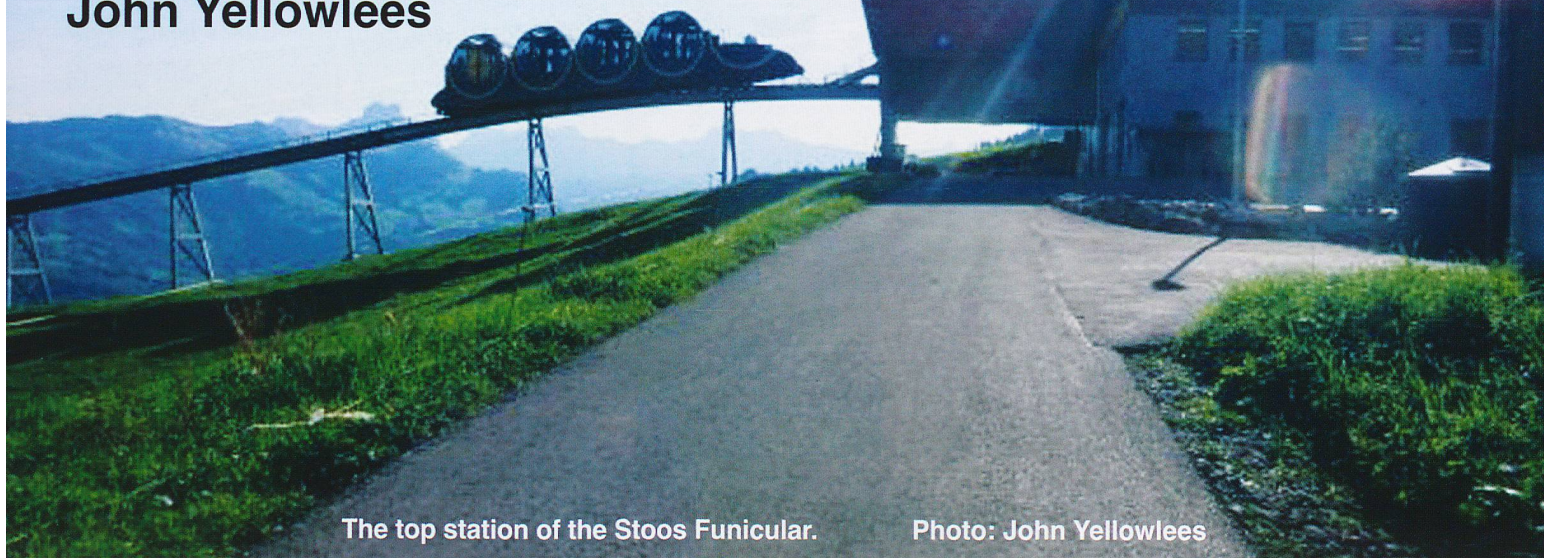
The top station of the Stoos Funicular.