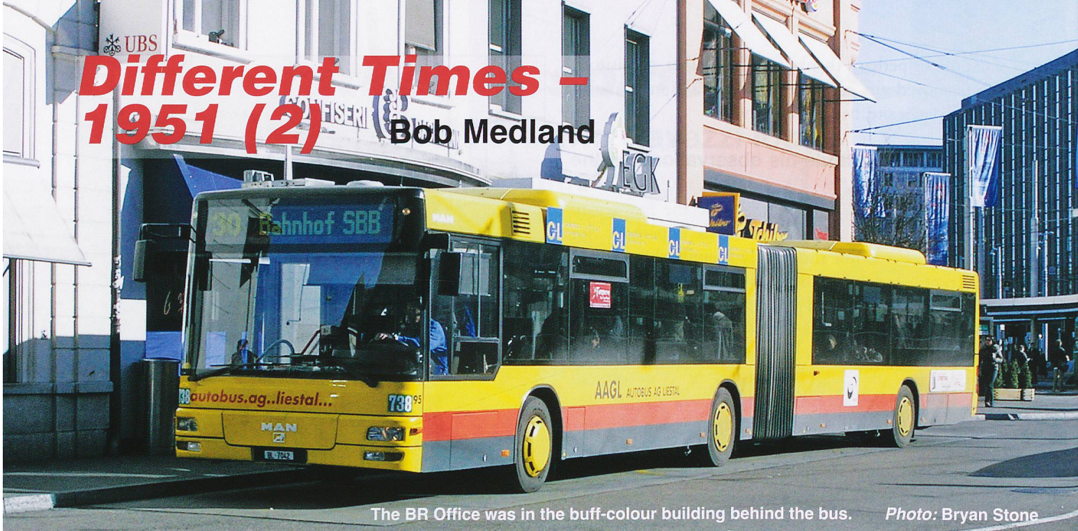
The BR Office was in the buff-colour building behind the bus.

A few weeks after Geoffrey Bryson completed his first trip to Switzerland - see Different Times (1) - an Express Delivery letter was handed into the sub-post office next to Basel Hbf. This originated from British Railways' 'General Agency for Switzerland' that was located on the SW corner of Centralbahnplatz on the first floor of No.9, above a branch of the Danzas Travel Agency. The creases in the envelope suggest that it contained a bulky booklet or similar – urgent tickets for the addressee, Mr Maidment, perhaps? The delivery address was in Basel's Millhauserstrasse less than 3km away across the city. In practice Basels Tram Line 1 passed close to both premises.