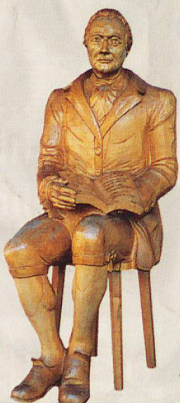
Johann Wolfgang von Goethe