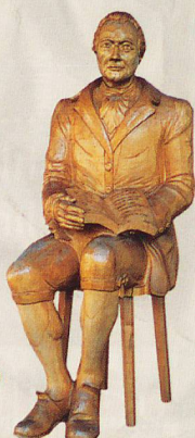
Johann Wolfgang von Goethe