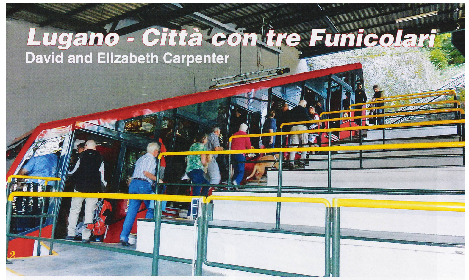
San Salvatore funi interchange station.

ugano, the largest city in the Canton Ticino (and the ninth largest in Switzerland), is home to three, once four, funiculars. The shortest, the Lugano Città, provides a vital transport link, whilst the other two are tourist attractions, providing access to views over Lago di Lugano from Monte Bré and Monte San Salvatore.