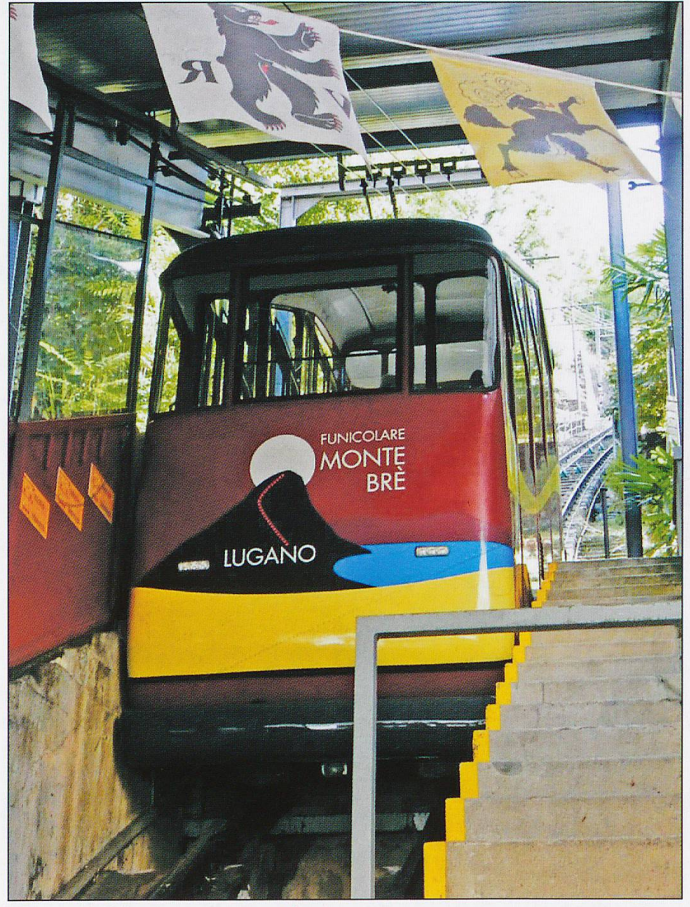
Monte Bré funi - upper section.

This funicular is in two separate sections, separated by a road, which passengers have to cross to get from one to another. The lower section is much shorter at 208m, with a rise of 102m. The journey takes 4 minutes. Despite the short length, it is a conventional single track funicular with two cars and a passing loop. The cars on this section date from 1959. The lower section is effectively a free ride, as tickets are sold at the lower station of the upper section. A turnstile, that allows 42 people through then locks to prevent overcrowding, controls entry. This causes problems when families and groups are separated, as there is no indication of how many