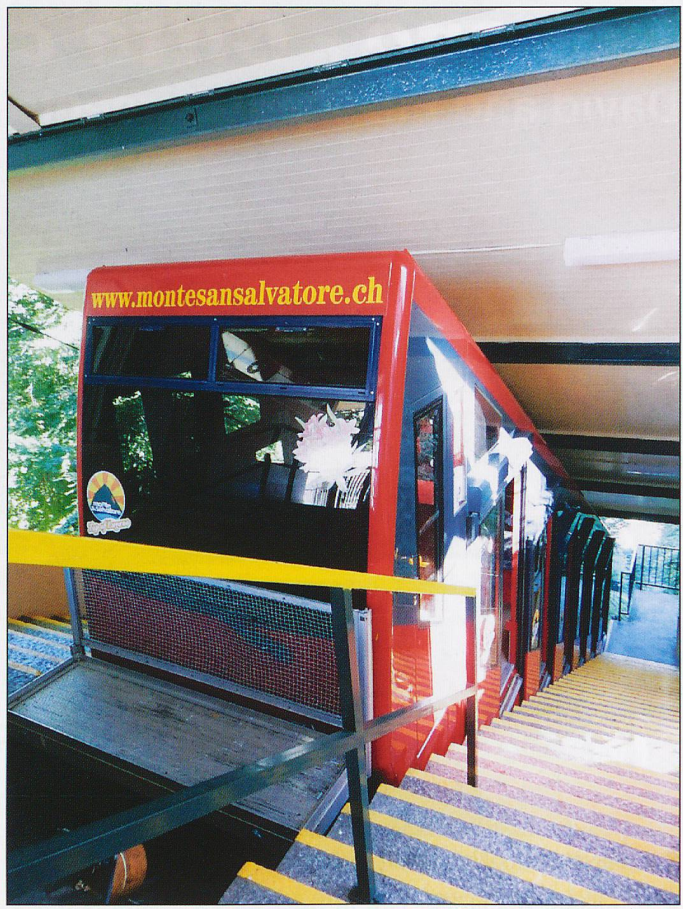
San Salvatore funi - top station.

more people the turnstile will let through.