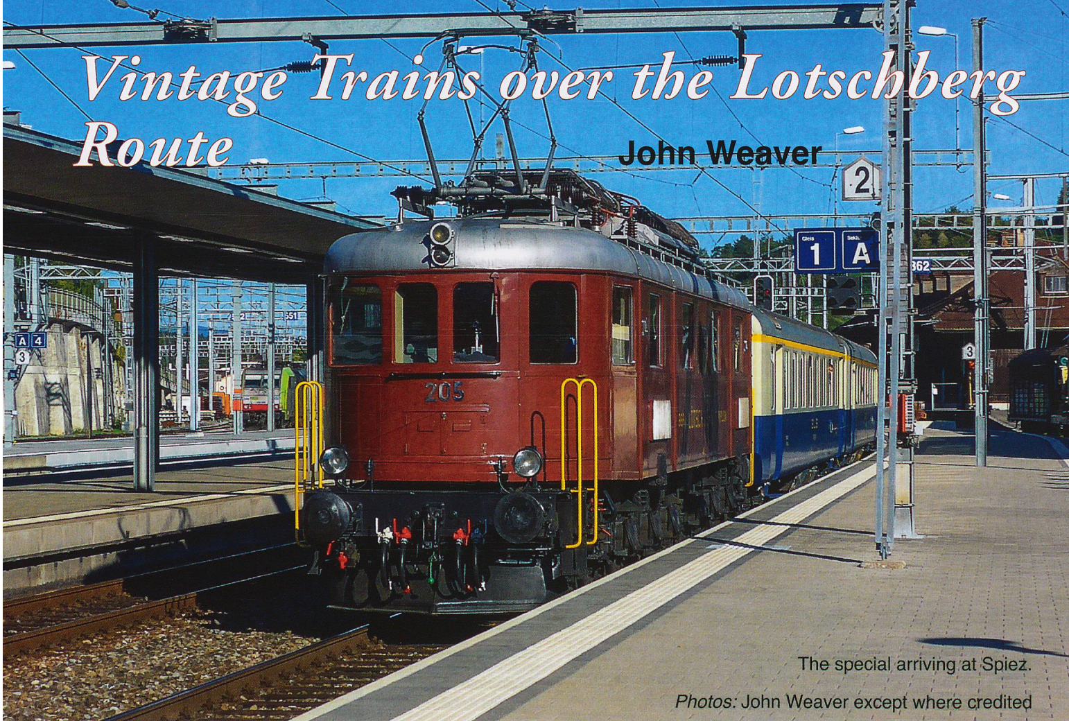
The special arriving at Spiez.