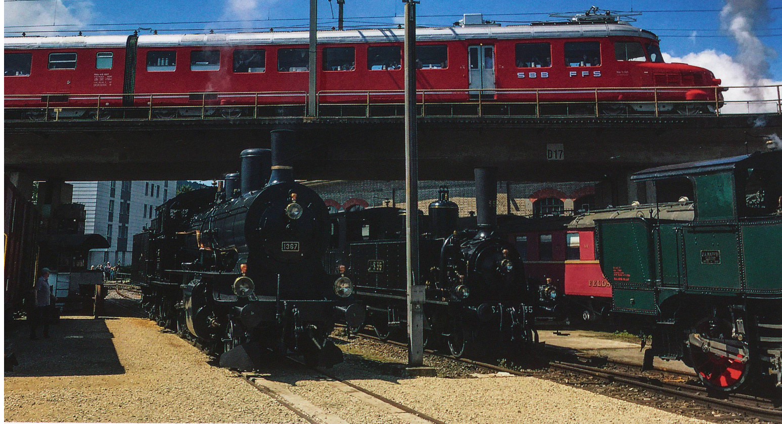
Churchill Arrow 1021 is on the main line. The loco to the right of 1367 is ex-Jura Simplon Eb 3/5 No. S35 (SBB 5469), a visitor from the Oensingen Balsthal Bahn.

B ahnpark Brugg is the oldest extant depot complex in the Mittelland of Switzerland. The four road straight engine shed was built here by the Schweizerische Nordostbahn (NOB) in 1892. This was supplemented by the 7 track roundhouse constructed by SBB and opened in 1912. The electrically driven turntable dates from 1905.