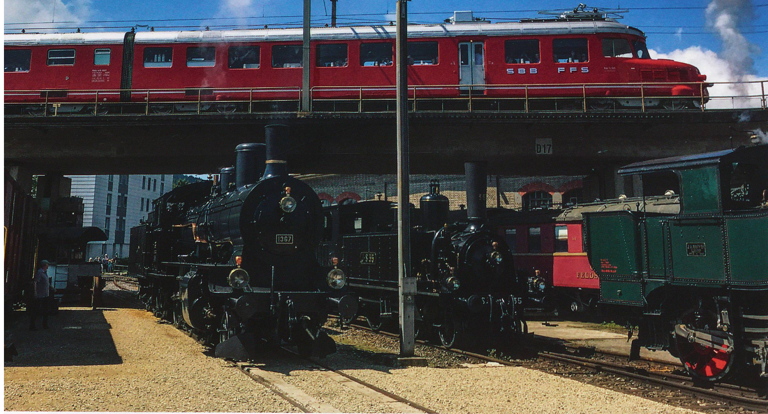
Churchill Arrow 1021 is on the main line. The loco to the right of 1367 is ex-Jura Simplon Eb 3/5 No. S35 (SBB 5469), a visitor from the Oensingen Balsthal Bahn.

B ahnpark Brugg is the oldest extant depot complex in the Mittelland of Switzerland. The four road straight engine shed was built here by the Schweizerische Nordostbahn (NOB) in 1892. This was supplemented by the 7 track roundhouse constructed by SBB and opened in 1912. The electrically driven turntable dates from 1905.