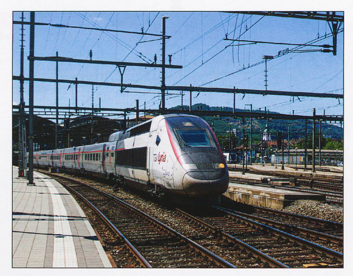
TGV set 4412 is seen here on 23/06/2018 taking the Basel line as it passes through Olten non-stop with the daily Bern to Paris Gare De Lyon service.

the daily service from Paris Gare de Lyon to Bern and is worked by a TGV Lyria set. The return working from Bern to Paris does not stop at Olten. The only other services that are booked to run through Olten non-stop are the hourly Brig to Romanshorn and St. Gallen to Genève Airport services in each direction. Both are usually worked by class 460s on double deck IC2000 stock. Occasionally a standard IC2000