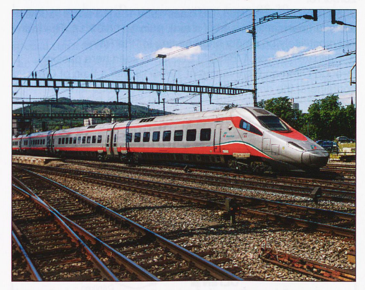
Following a fall-out between the Swiss and Italian rail authorities, the 14 strong fleet of class 610s were divided between the two companies. Trenitalia owned ETR. 610008 is seen departing Olten, on a Milano to Basel service on 23/06/18.

For the international traveller, there are 4 workings each way to Milano and 5 services each way to stations in Germany. The Milano services are usually worked by class 503 and class 610 sets, whilst most of the German trains are in the hands of ICE 1 sets. The 2018 timetable saw the introduction of a through Frankfurt to Milano train. The train travels south via Luzern and the Gotthard, whilst the northbound service is routed via the Simplon, the Lötschberg and Bern. This is the first through service between Germany and Italy via Switzerland for several years and is worked by a class 503 unit. The other notable working in the timetable is