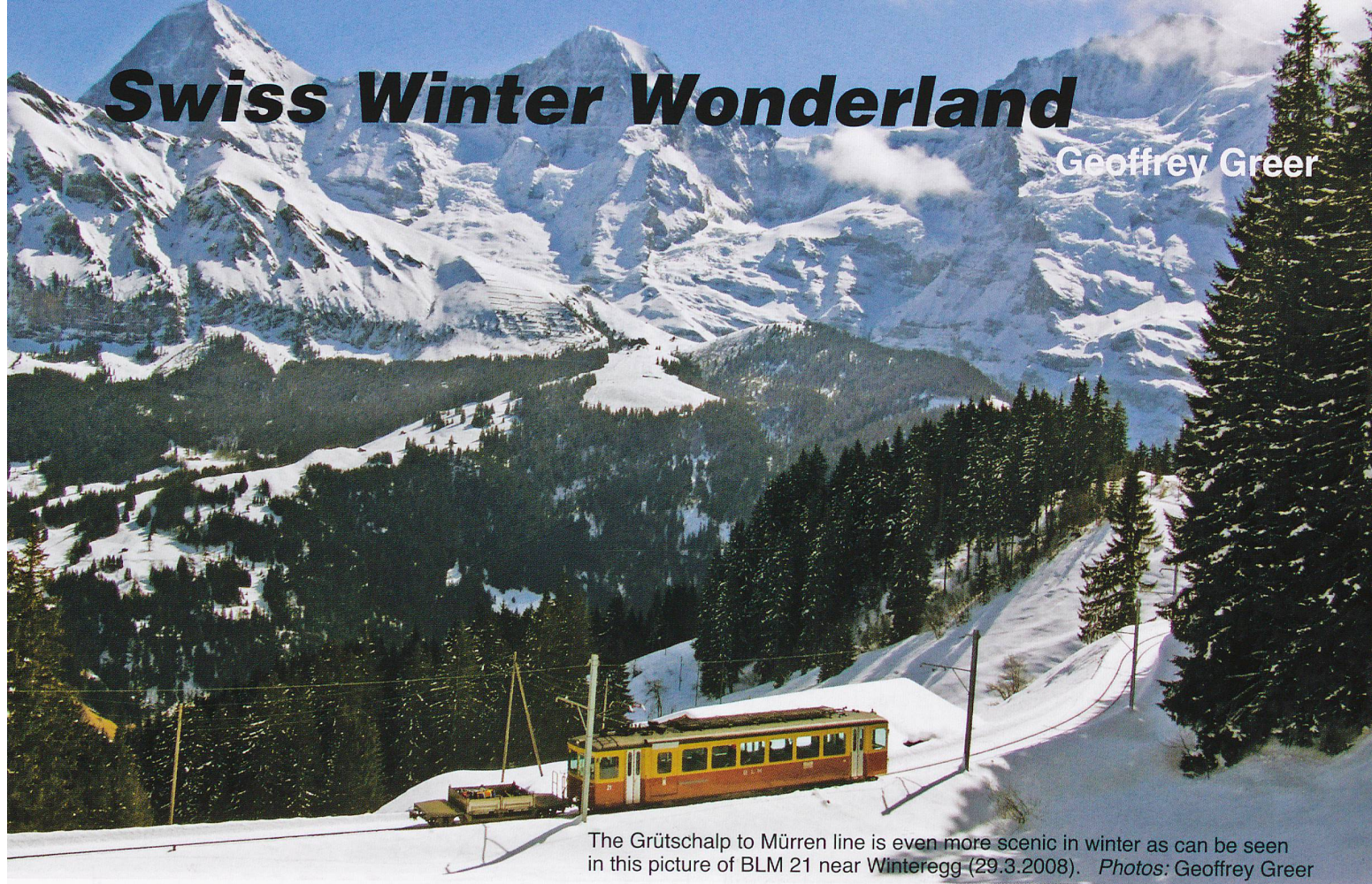
The Grüttschalp to Mürren line is even more scenic in winter as can be seen in this picture of BLM 21 near Winteregg (29.3.2008).