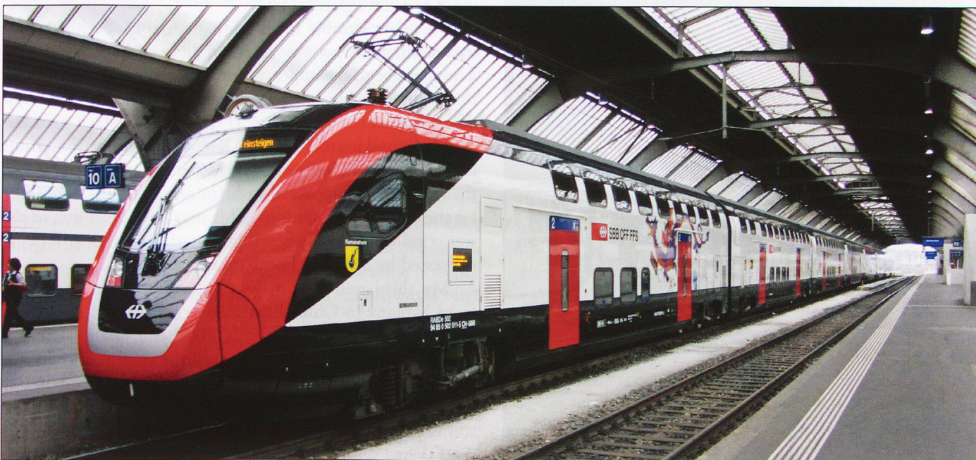
SBB. Class 502 IC at Zürich, 06.06.19.

So overall, the trains are an excellent addition to the SBB stock. My concern is that they will soon become crowded and the SBB will need to double up the trains after only a few years of operation. It may have been better, in hindsight, to purchase double deck trains for all the Inter-city routes, including the Gotthard. Operation to the full timetable on the Gotthard route is intended from the introduction of the December 2019 timetable.