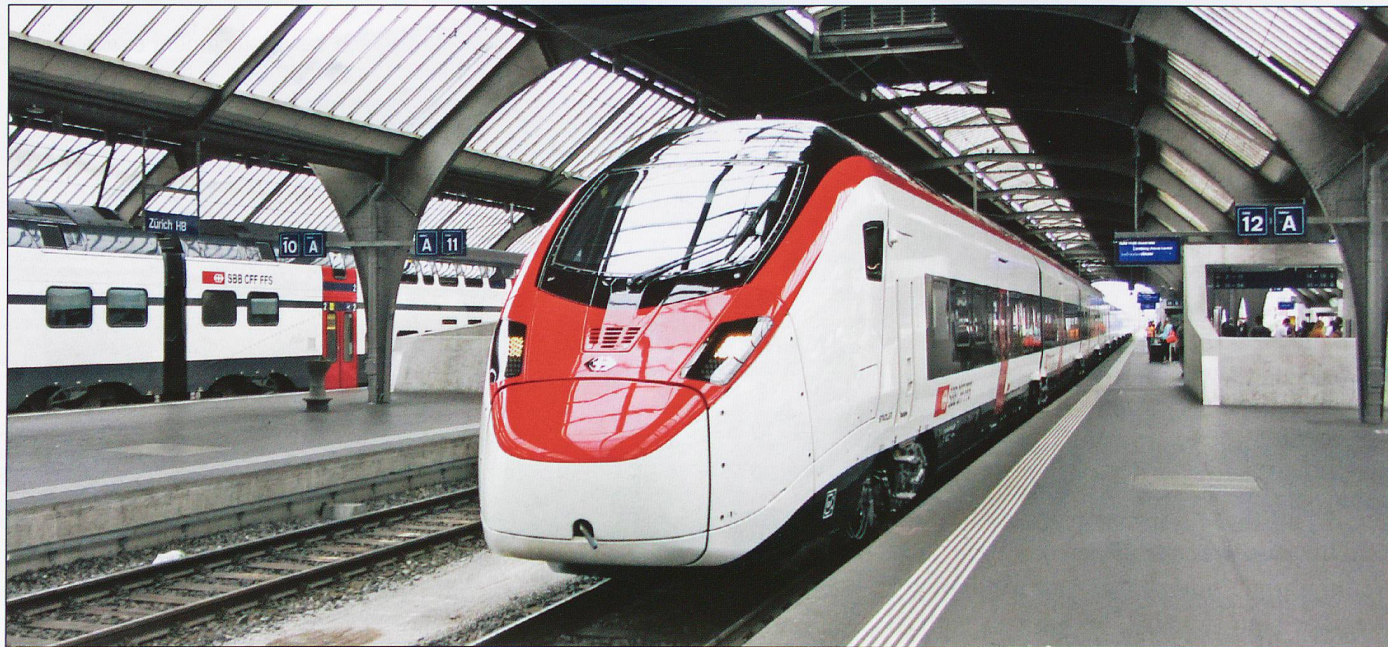
SBB Class 501 arriving at Zürich, 11.07.19

The troubled introduction of SBB's new Class 502 FV Dosto units has been discussed in recent issues of Swiss Express . In contrast the launch of the Stadler Class 501 'Giruno' trains for the Gotthard line has been much less fraught. Jason Sargerson has travelled on examples of both these new classes and presents here his first impressions of SBB's new flagship trains.