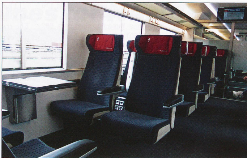
SBB Class 501, 1st Class, 11.07.19.

The acceleration was very smooth and there was little engine noise. In my carriage though, there was an annoying hum, either from the air conditioning or the electrical equipment in the carriage. The seats in first class were comfortable, but they were relatively firm, not quite as good as Mark IV seats. There is room both under and between seats for luggage. The seats match the windows and there is a blind to reduce glare. There are sensible small folding tables between some seats, but longer tables are present at others. The windows appeared to be relatively small; this may be