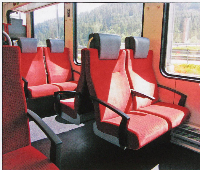
8. SOB, Class 526, 2nd Class.

The eighth seat is in an SOB Class 526 2nd Class coach. This is in the FLIRT units operated by SOB. This seat is a more Spartan than others, although comfortable for shorter journeys. It is less substantial than the other seats discussed here, with smaller headrests and firm armrests. There is room for luggage beneath and between the seats. The environment is usually quiet, although the coaches are motorised. There