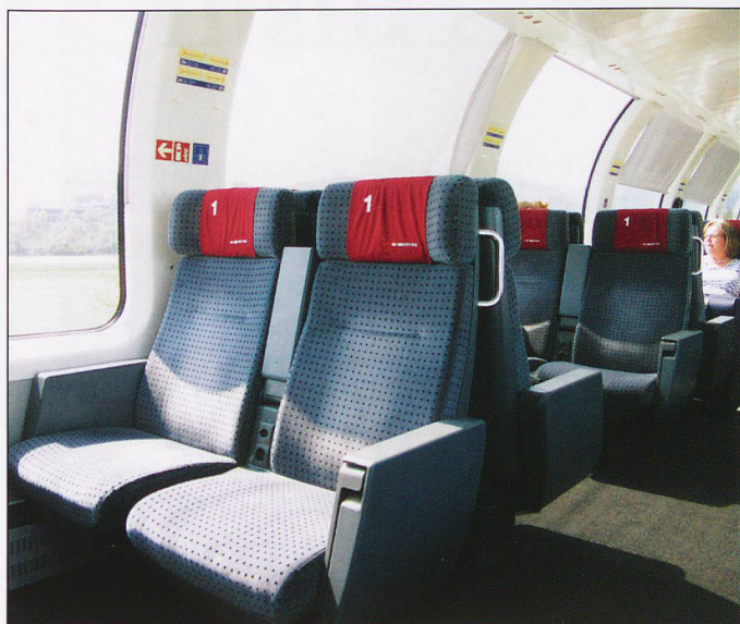
7. SBB, Panorama Coach, 1st Class.

The eighth seat is in an SOB Class 526 2nd Class coach. This is in the FLIRT units operated by SOB. This seat is a more Spartan than others, although comfortable for shorter journeys. It is less substantial than the other seats discussed here, with smaller headrests and firm armrests. There is room for luggage beneath and between the seats. The environment is usually quiet, although the coaches are motorised. There