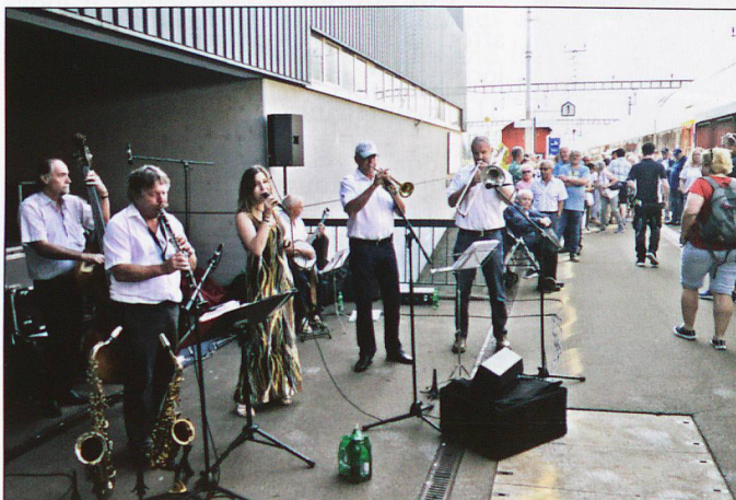
The 'First Field Jazzband' welcomes the guests.

An exact aluminium replica of the Ae 6/6 nameplate adorns the restaurant car.