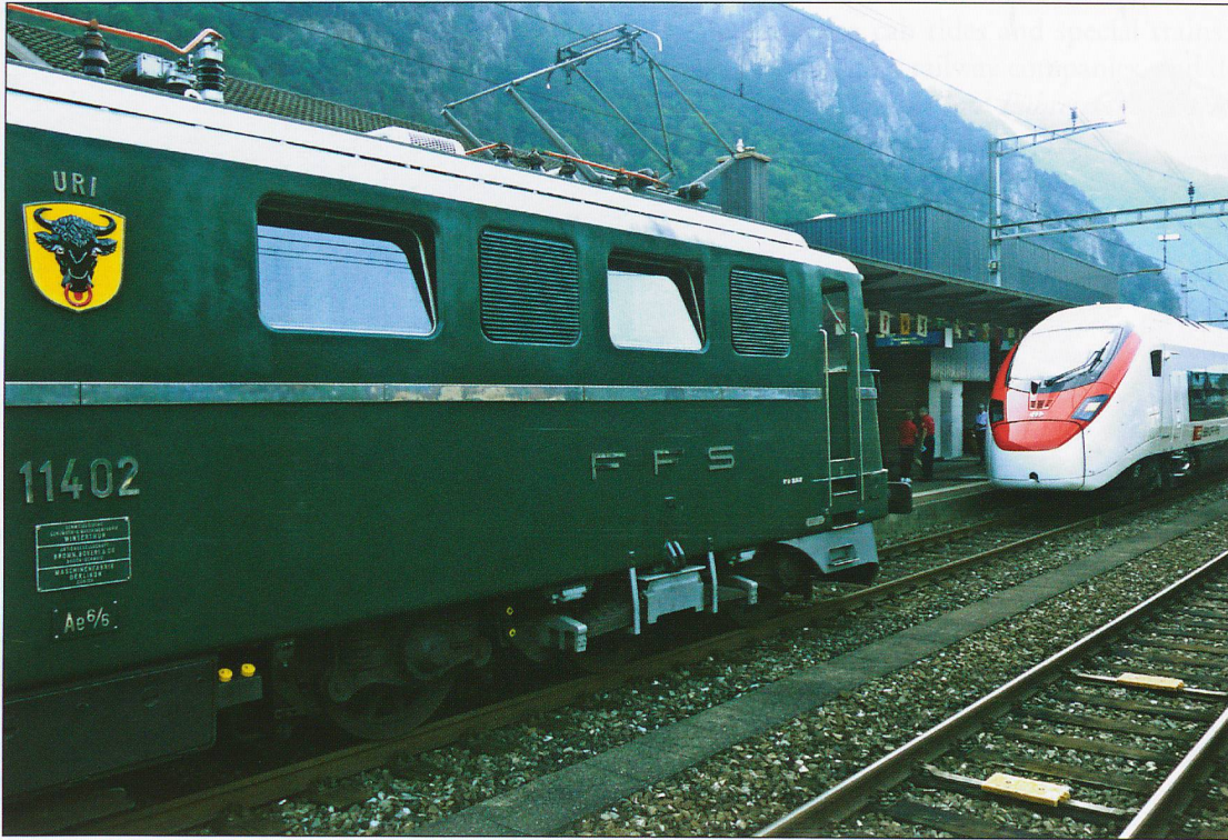
The old 'Uri' and the new 'Uri'.