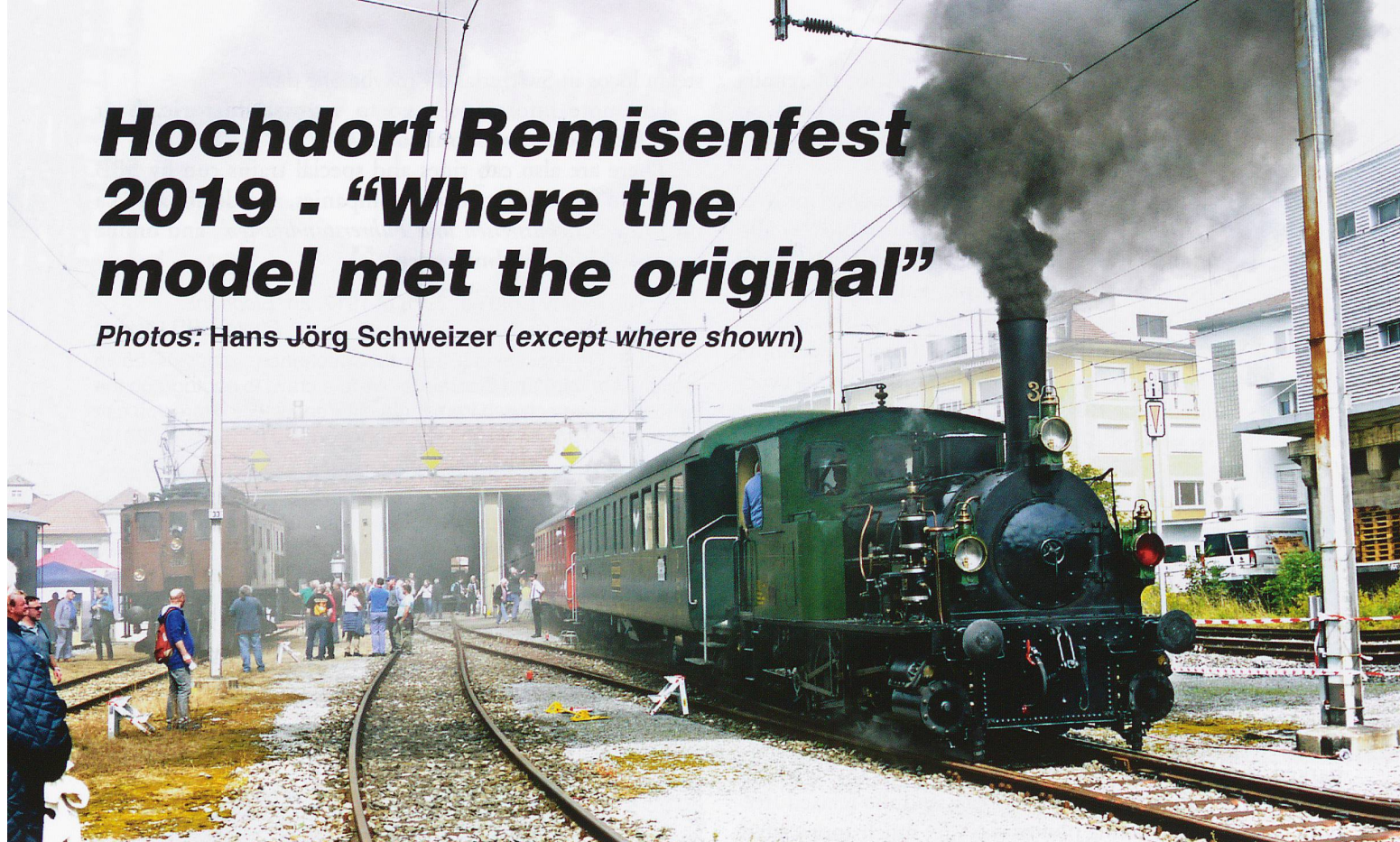
E3/3 'Beinwyl' in action