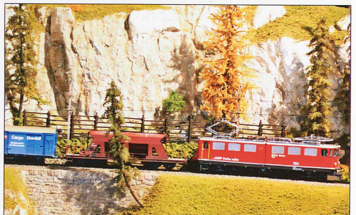
Ge 6/6' 703, St. Moritz, with a freight working.