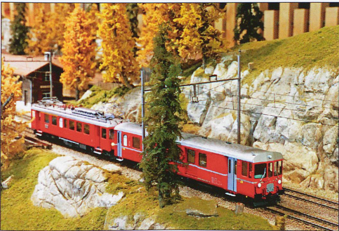
Driving Trailer BDt 1721 is pushed by an ABe 4/4 Triebwagen.