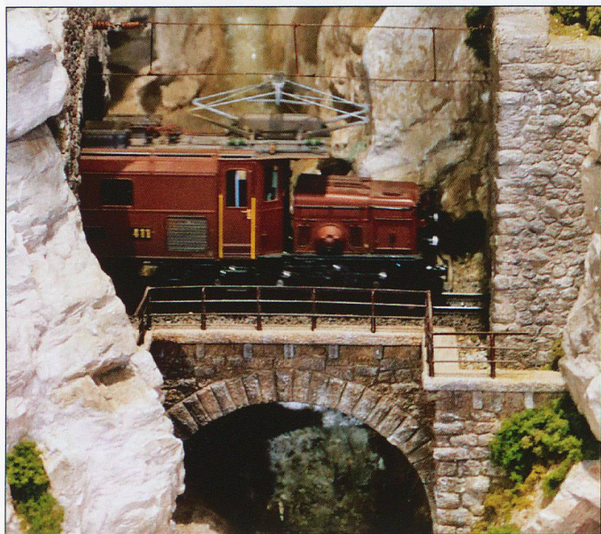
Not on the Albula line in real life, this is the bridge joining the Wiesen I tunnel and the Bärentritt tunnel on the Filisur to Davos line. The gap is only about 10 metres. It is easier to photograph on the model than in real life.