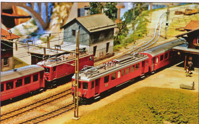
Abe 4/4 No 503 crosses a passenger train pulled by Ge 4/4' 608 Madrisa. 608 is in its modernised state which didn't happen until the period 1986 to 1991.