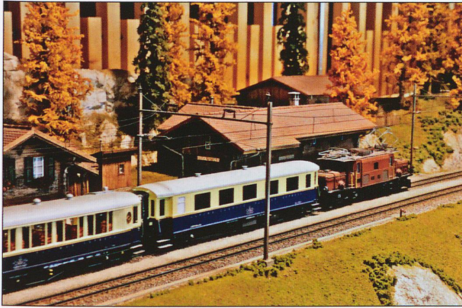
Ge 6/6' 411 and a rake of Alpine Classic Pullman coaches in Stugl-Stuls station.