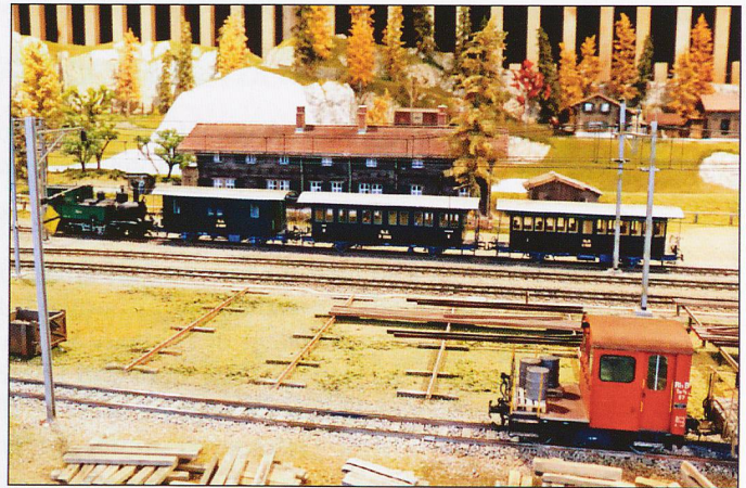
G 3/4 Raetia with historic coaches. In the foreground is a Tm 2/2 No. 57.