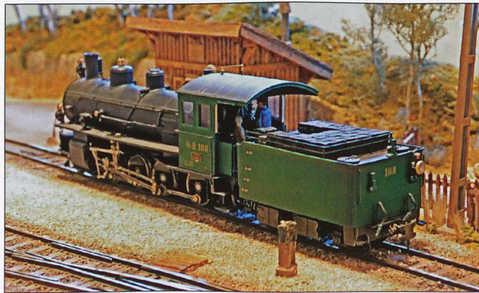
RhB G4/5, now renamed Engiadina has just backed out of its engine shed.