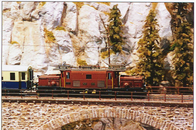
A Ge 6/6 I crosses one of the layout's viaducts