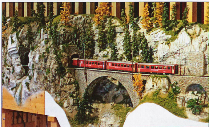
The whole layout is very impressive, and the workmanship is outstanding.