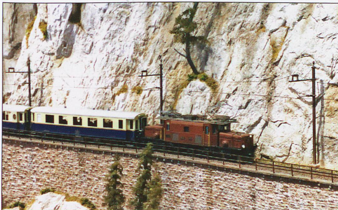
Baby Croc 411 with Alpine Classic Pullman stock.