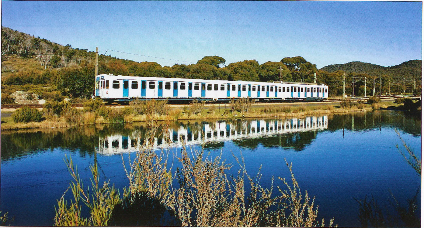
A SkiTube train commences its ascent near the Bullocks Flat terminus.