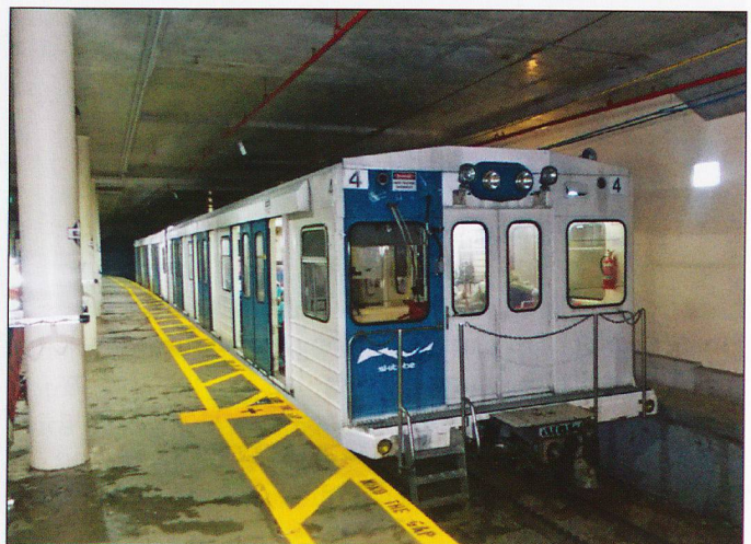
SkiTube at Blue Cow station.

SkiTube's large valley terminal is next to a large car park at Bullocks Flat in the Kosciuszko National Park. The railway descends to the Thredbo River, which is crossed via a large bridge, and it then commences its climb. There are magnificent mountain views. But, unfortunately, after only two kilometres the railway enters a tunnel ending the vistas. The major station of Perisher Valley is situated after four kilometres. The tunnel then resumes for a further 2.5 kilometres to Blue Cow.