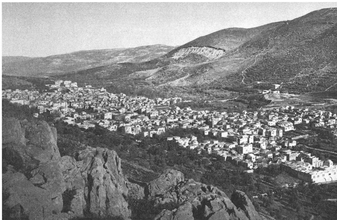
Fig. 3: Nablus, 1898.