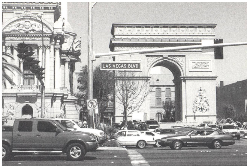
The constantly changing face of the Strip is moving further and further away from the image of the western frontier and many of the new casinos are themed after metropolises such as Paris, Venice or New York.

conventional cities guides and directs people along certain axes, according to a particular city's civic infrastructure and optimised traffic flows. Las Vegas, however, was and still is centred around the Strip, catering exclusively to the economic demands of the casino industry. 4 Behind every sign, every sophisticated façade something is luring the „guests“ to spend more money, just as every trodden tourist path inevitably ends in front of a shop or in the case of Las Vegas in front of a slot machine. Yet despite everyone's full awareness of this, the casino's artful and spectacular designs match our personal receptors on any number of levels. Las Vegas has mastered the iconographies of desire.