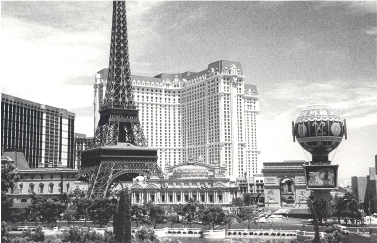
The casinos offer replicas featuring exactly those quintessential elements which make a city immediately recognisable.

and know it is not real; even though we see the seams we quite generously play along. What counts is the entertainment value and the real emotions which are evoked: wonder, happiness, and pleasure.