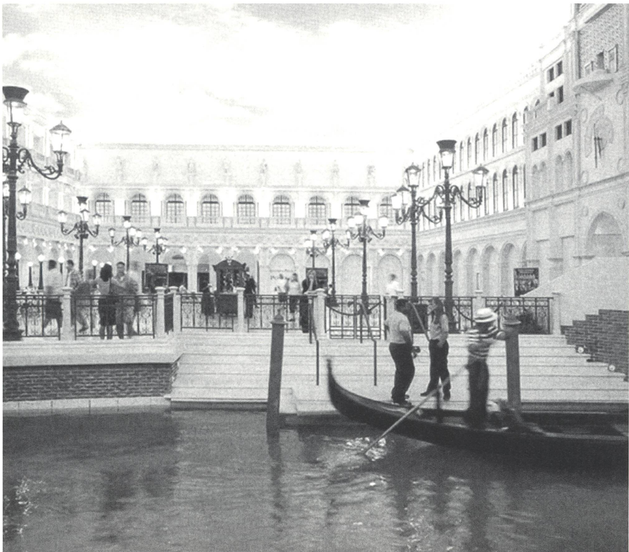
Not only the exterior, but also the interior's perfection in the staging of a theme engulfs the visitor in a sophisticated narrative, where boundaries between spectator and actor become blurred.