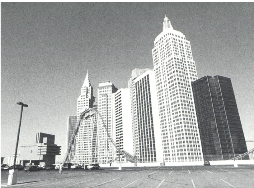
The casinos have worked out unifying themes for their exterior and interior. Twelve of Manhattan's landmark skyscrapers characterise New York, New York's hotel tower.

Strip has begun to resemble the layout of Disneyland. Similar to the Magic Kingdom, the casino-hotels are neatly divided into themed 'lands' along the Strip. It is therefore no wonder that it is now frequently described as Disneyland-for-adults. 14 There are undeniably striking similarities and influences, with strong tendencies towards a Disney-inspired skilled staging of envelopment-by-theme.