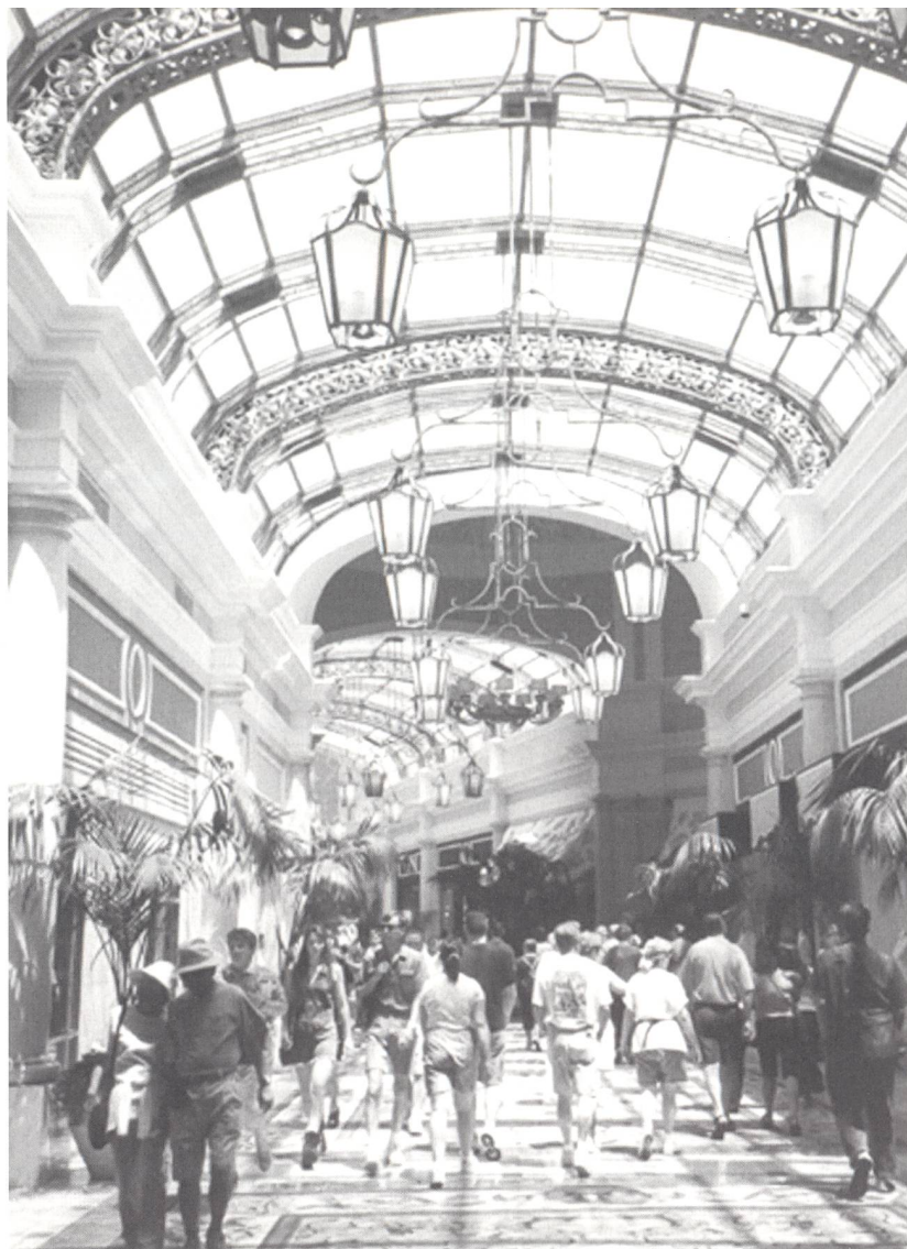
Bellagio's theme of the real extends to the use of natural light in its upscale shopping mall arcade.