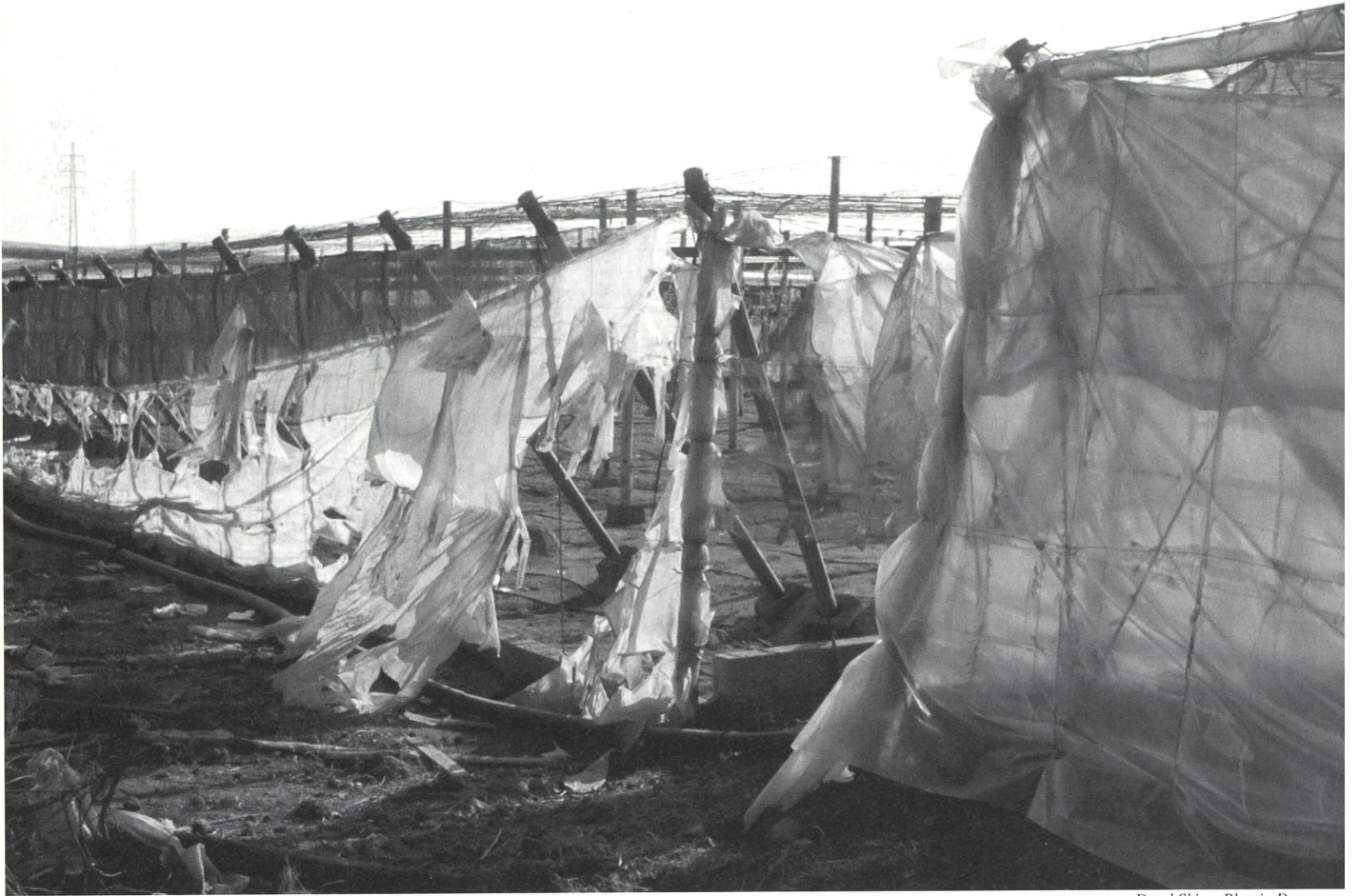
Dead Skin - Plastic Decay