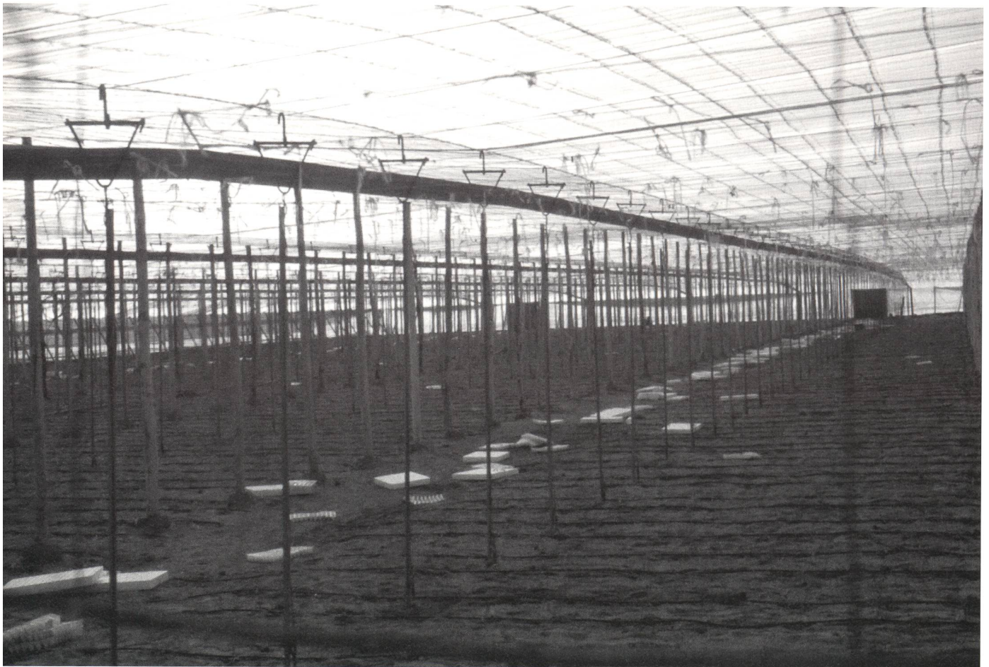
Inside the Membrane