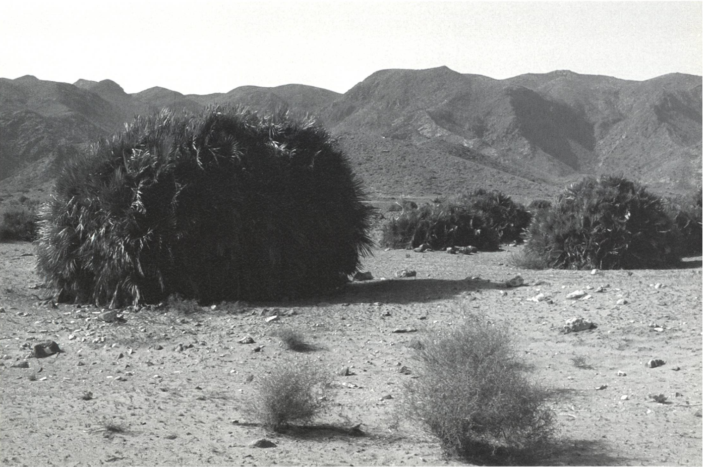
Natural Fan Palm Biotope