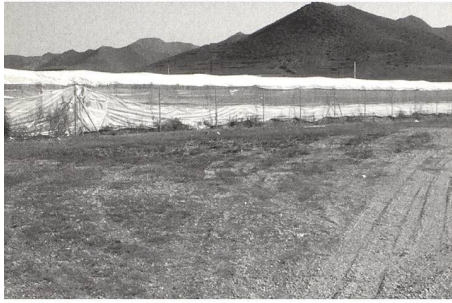
The Landscape Membrane