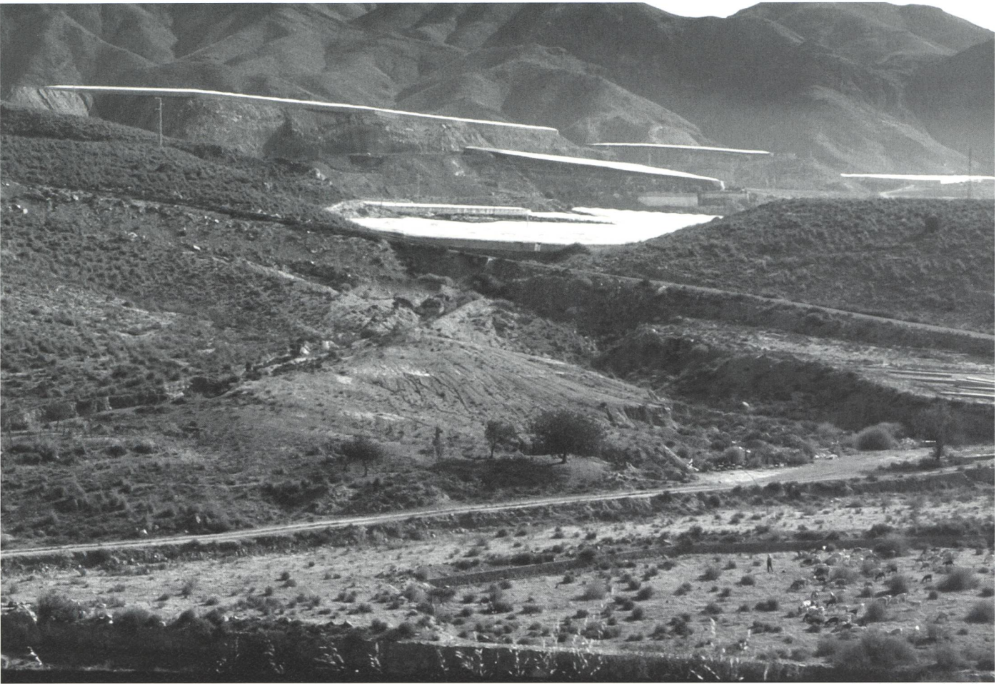
Vinyl Scales on the Hills