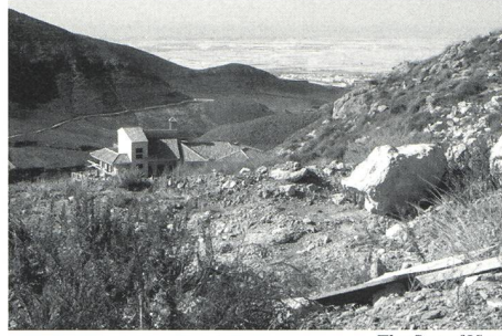
The Sea of Vinyl