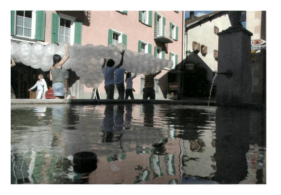
Fig. 2, Transubstance workshop , structure made of air in the air, Bergün/Switzerland, 2005, photo by Paolo Tringali.

The workshop Transubstance took special interest in surface-elements as boundaries of a potential mass. As Rudolf Arnheim notes, "boundaries are the precarious products of opposing forces," and in fact a figure-background relation can be reversed both due to qualities of boundary, that is surface, as well as the qualities of bounded space. Thus in the workshop, we looked at surfaces not as passive elements subordinated to mass, but as an active medium of transition between the substance of mass and the vacuum of space: a transubstance. However, rather than start with forms and formal qualities, we developed highly conceptual and subversive argument, while asking ourselves several questions, like "What is the surface of darkness like?," "What is the surface of air like?" or "How superficial is the surface?" and "How deep is the surface?" The questions could be encountered with two strategies. The first