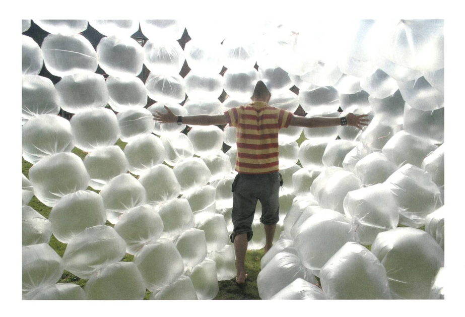
Fig. 3, Transubstance workshop , structure made of air in the air, Bergun/Switzerland, 2005, photo by Paolo Tringali.

projected on the ground. Apart from the contradiction between the articulation and the scales of graphic and surface, there was also a symbolic clash of an image and an object. The work with symbolism was continued by projections of various texts onto people's bodies. The installation of "superficial surface" brought attention toward relativity of existing surfaces, which surround us, and the existence of the specific thing behind them, which we take for granted everyday. By simple projections, the "superficial surface" put into question that substantiality of a thing. It made us imagine a vacuum behind the surface, or "other" space behind the surface. Moreover, on the rebound it questioned the nature of space, from where we, as observers, actually look at things. In both cases, work on the installations continued with a similar experimental character as the conceptual discussion, and opened it further, rather than to bringing it to a conclusion.