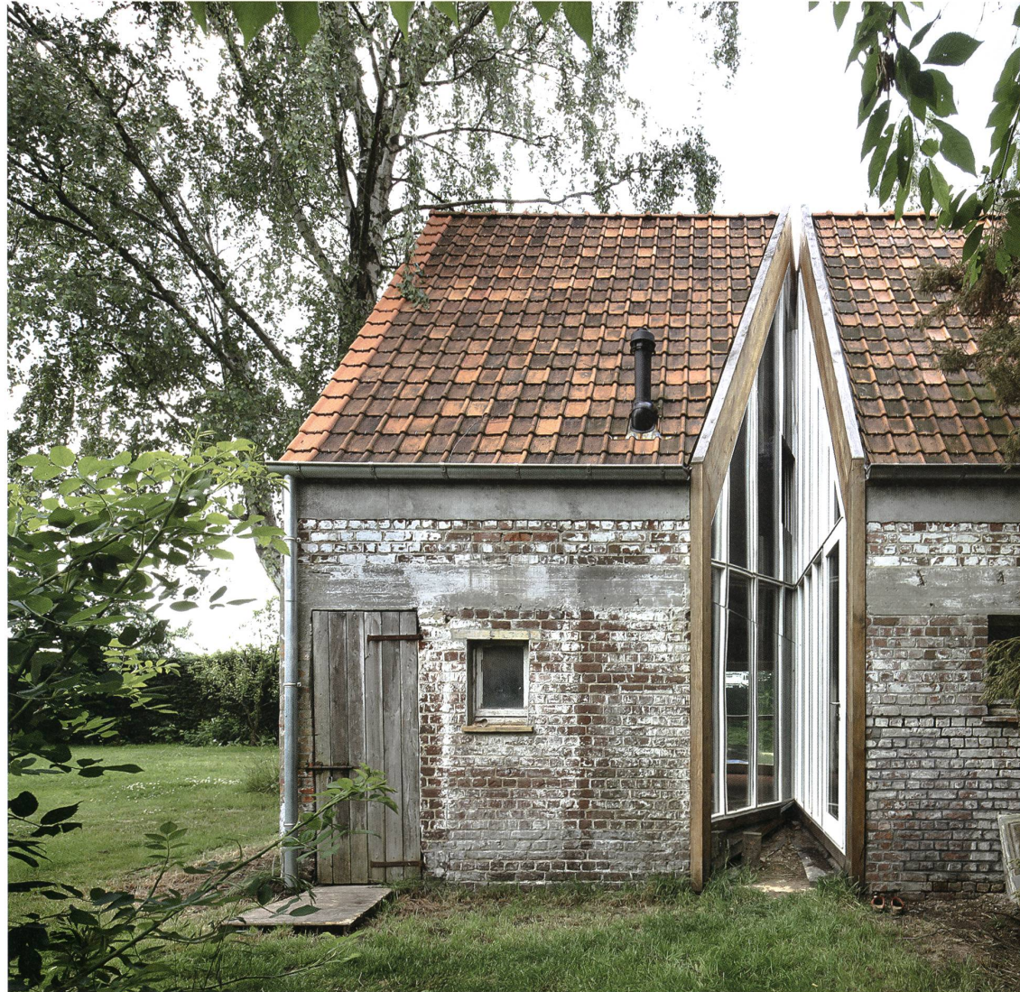
fig. a. Haus Kouter, ADVVT. Photography: Filip Dujardin, 2013.