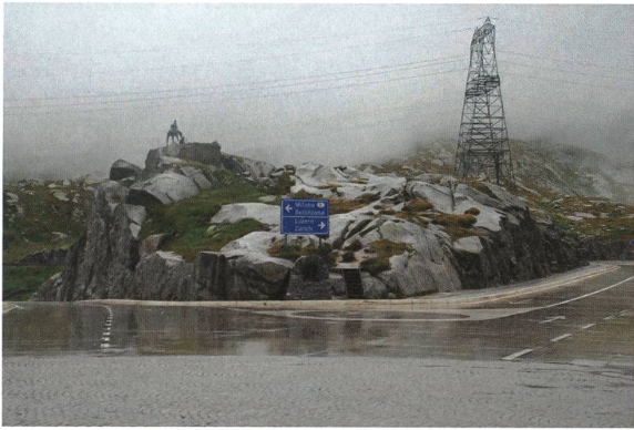
fig. b. San Gottardo Double, ADVVT, photographed with a one year interval.