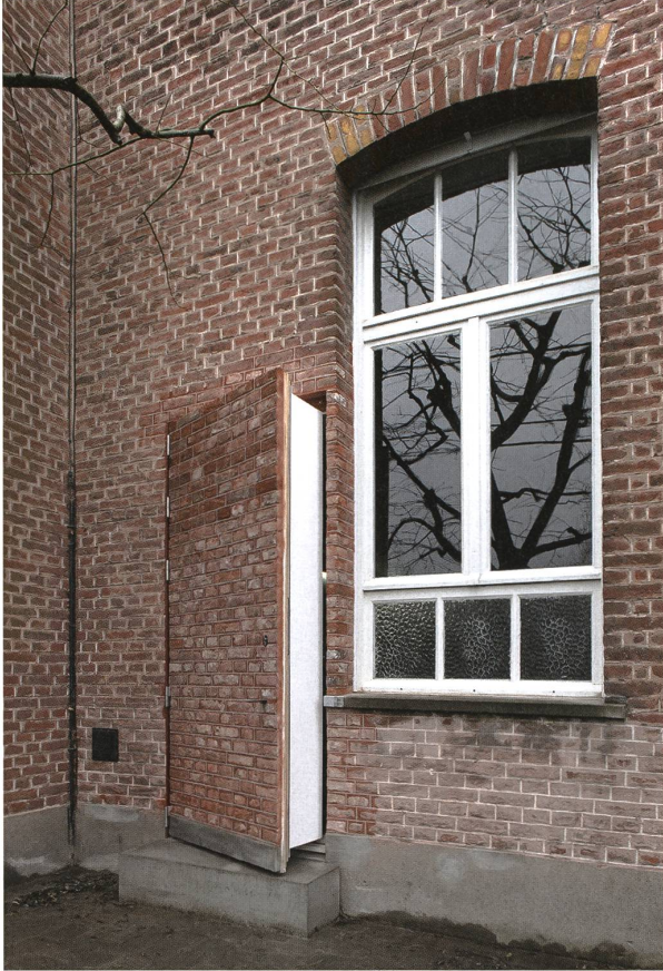
fig. f. Haus Weze, ADVVT.

disdained squatter, they enact fictions, which are used as tools within their work—allowing arbitrariness to become order—and as a way both to raise awareness towards reality and to foment the reader's appropriation of space. This is done not by using fabulous metaphors—like that of a winged lion—but by setting up a tectonic narrative, related to a vernacular architecture of rooms and windows.