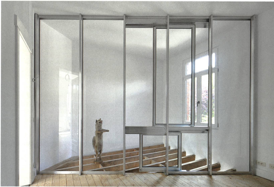
fig. d. Haus Vos, ADVVT.