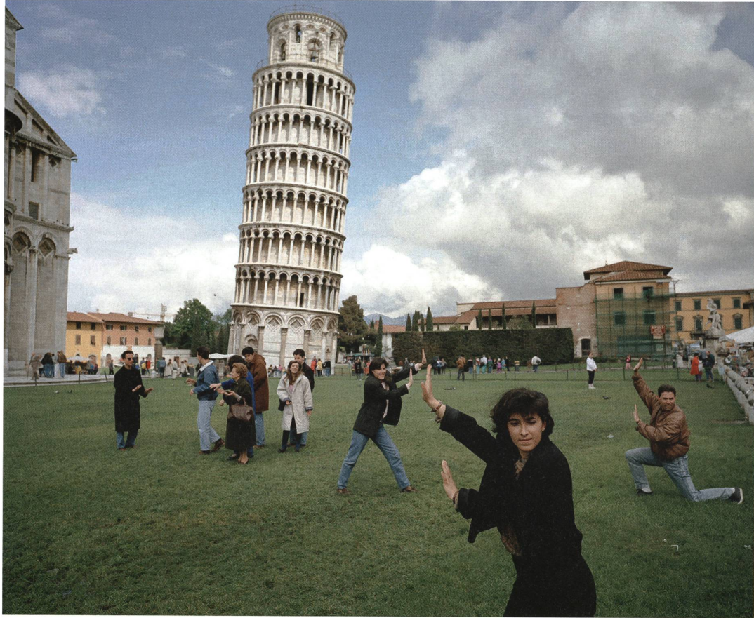
fig. e. Tower of Pisa, Martin Parr, from «Small World», 1990.