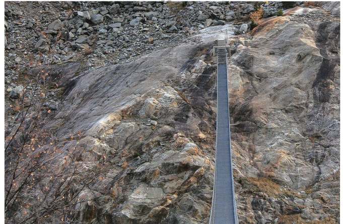
«At the bridge, you could feel that the glacier was supposed to stop nearby, but from here, you cannot see anything of it.» Azadeh Karimi

«Climate has always shaped architecture. For instance in Africa, there always have been earth igloos or Rondavels which are very effective to protect against heat, the pile houses on the water in Indonesia or the blockhouses in the Alps. I think it could be very interesting to re-integrate that into our designs, re-work with the region where we are. This could also change the way people think about the site, make them feel more rooted in a way, care a bit more about where they are and therefore maybe try to preserve it too.» Filippo Cattaneo