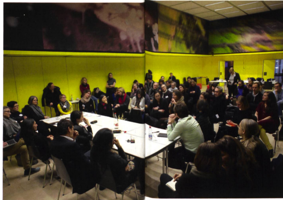
Document 2, dated March 8, 2016: 'Parity Talks' photos