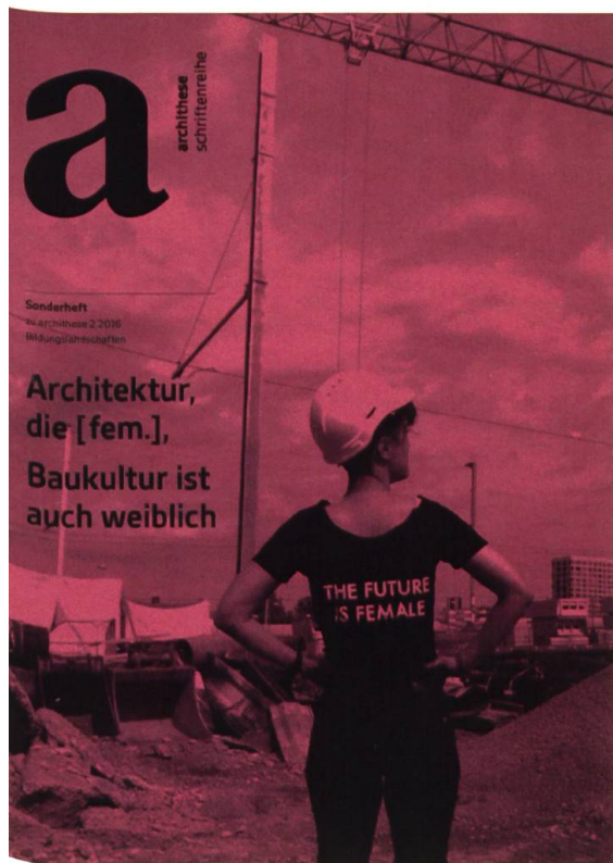
Document 5, dated June 8, 2016: special issue of Archithese 'Architektur, die [fem.], Baukultur ist auch weiblich!', no. 2 (2016)