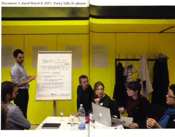
Document 3, dated March 8, 2017: 'Parity Talks II' photos

single one of these PhD theses had been produced under a female supervisor. While some of the former doctoral students seem to have literally disappeared after earning their degree, a handful have ended up in positions far below their level of qualification. Many others have pursued careers outside ETH Zurich, whether in Swiss Universities of Applied Sciences or abroad. 8 It seems to be instances like these, in which the otherwise deceptively abstract phrase of the 'leaky pipeline', taken on a personal dimension.