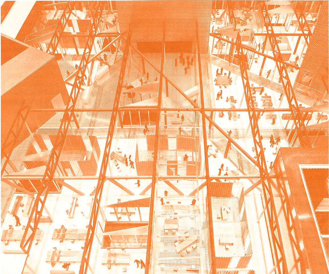
A Pearl Route, Al Muharraq, BH C Radio & Television Building (RTS), Lausanne, CH