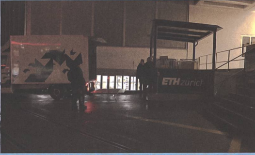
~ 07:00 Transport was leaving logistics and the left empty space in logistics center.