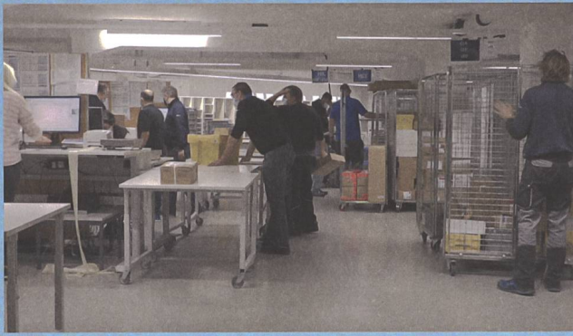
~ 06:15 The chauffeurs from transport and the staffs of logistics center in ONA were sorting out the packages and letters together. It was the busiest moment at logistics. Much energy and sweat, much noise and laughter.