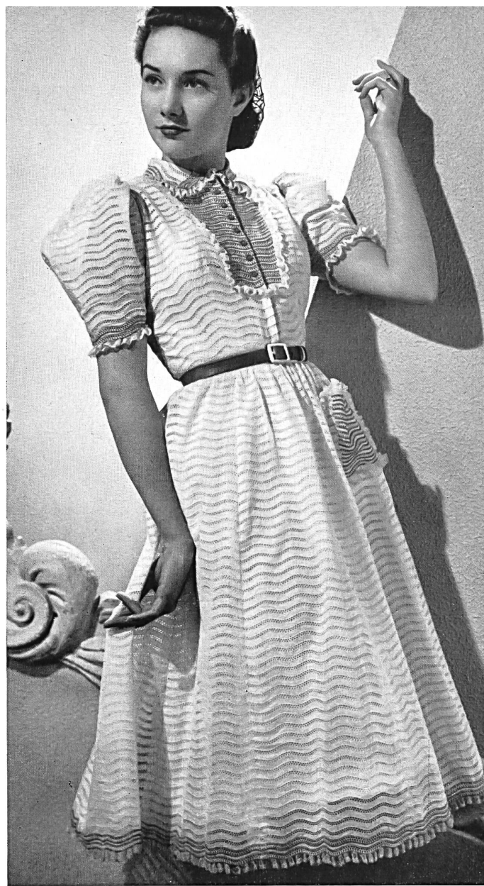
Afternoon frock in St. Gall embroidered lawn. A Heim Jeunes filles Model. Tissue of the firm Union S. A., St-Gall

A certain Heim-Jeunes-Filles model is most desirable. It is of lawn embroidered with long wavy lines of drawn-thread work and is charmingly youthful. The skirt is short and full and flutes gracefully; the bodice, gathered at the waist