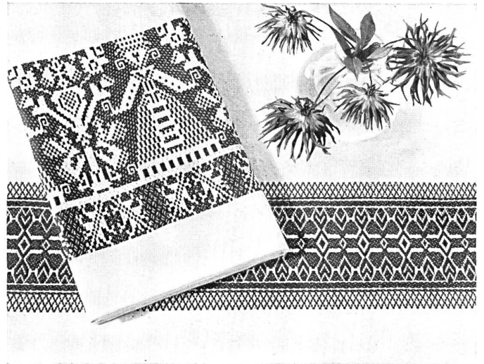
"Renaissance" Fabrics created by Tissage de Toiles de Langenthal S. A. Langenthal.

The Swiss linen industry, which already has many years of research and experience behind it, delivers admirable fabrics which unite the two qualities of durability and good taste.