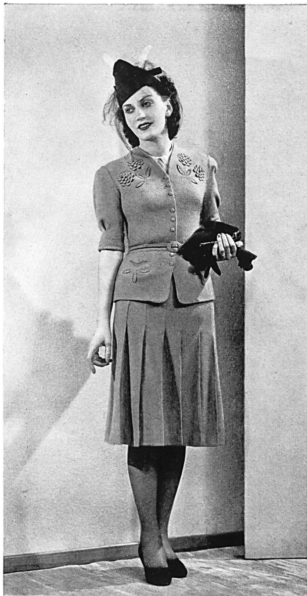
Two-piece by Yvel Jersey Manufacture, Zurich.

children's frocks, soft layettes for babies, and ladies' jumpers and sport blouses.