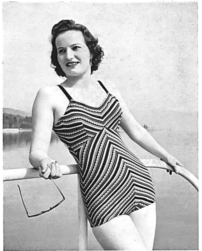
Swim suit, by Ltd. Company formerly W. Achtnich & Co., Winterthour.

Underclothing of all kinds whether in silk, wool, or in silk and wool and cotton, are both supple and hard-wearing and continue to receive high praise.