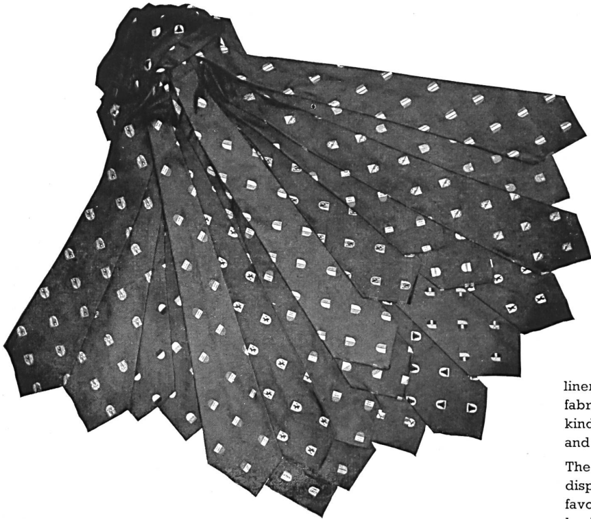
Swiss specialties : Neckties and silks for neckties