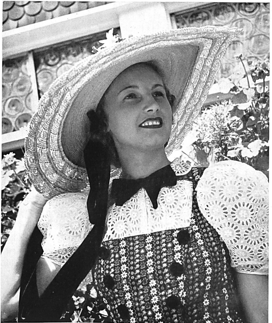
Maitschidress with hat of straw braids of Wohlen.

Swiss organdies and St. Gall embroideries stand every chance of being popular in the United States. Keen-aired Switzerland provides America with fresh and dainty fabrics as colorful as flowerstrewn prairies, to adorn its hot summer days. These flowery charms bloom on the printed or embroidered dresses presented by the famous robot mannequins from the Swiss National Exposition in Zurich.