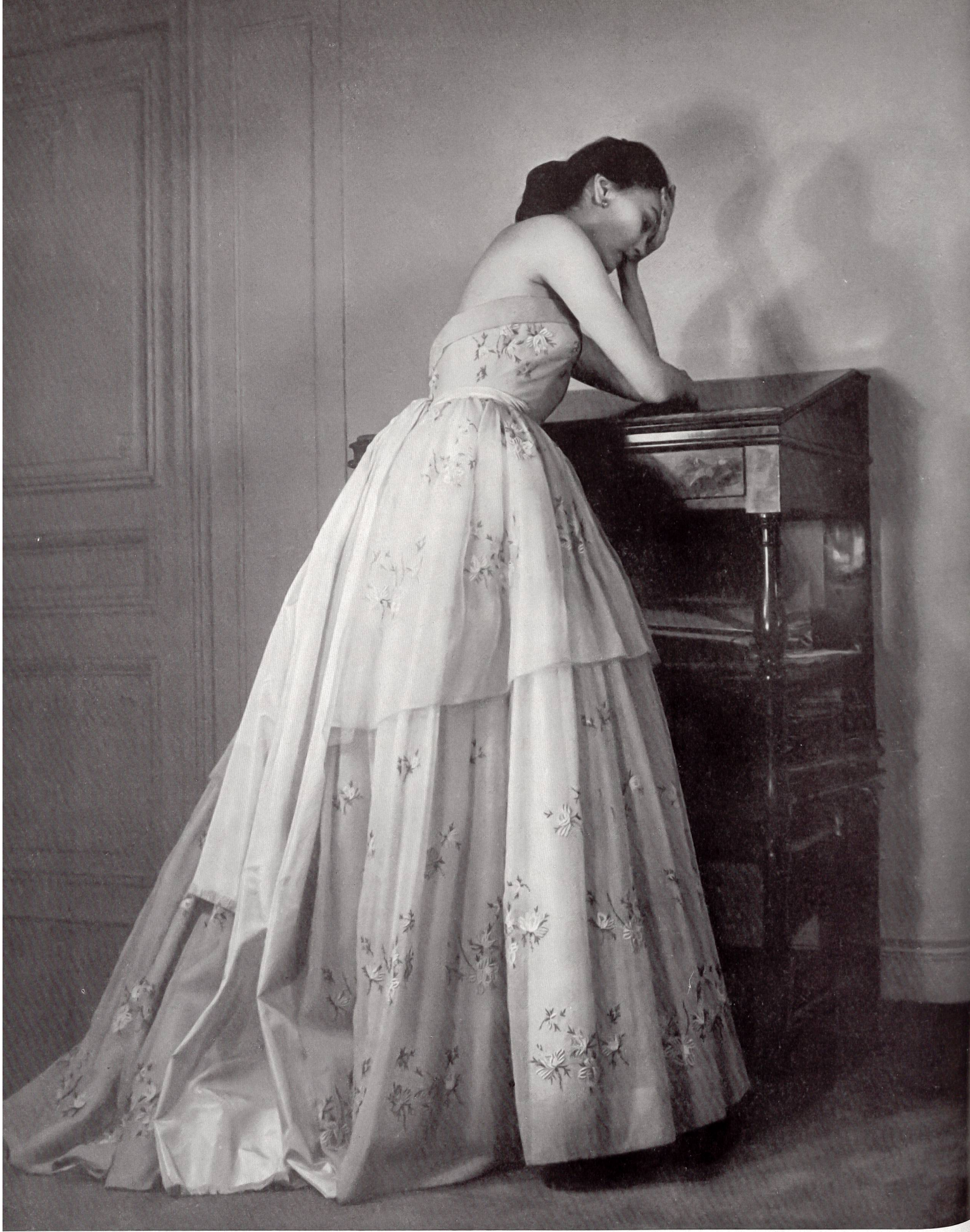
CHRISTIAN DIOR A. Næf & Cie, Flawil INAMO, ZURICH