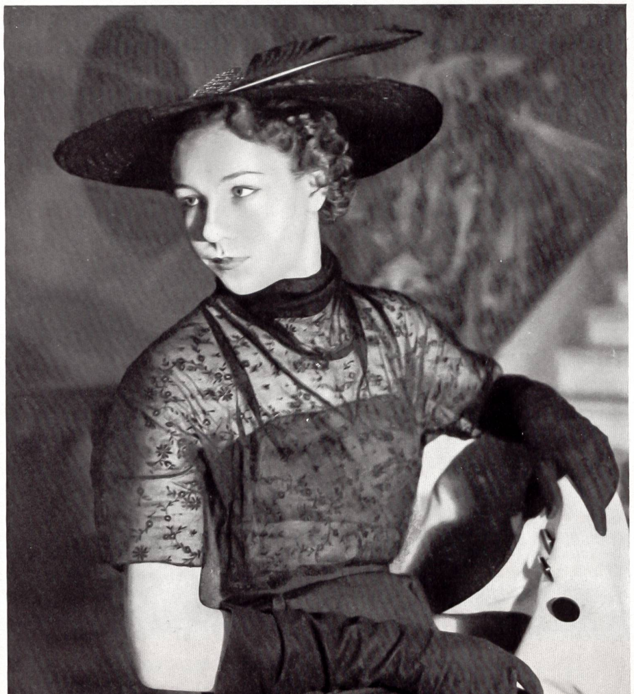
BRUYÈRE Hufenus & Cie, St-Gall THIÉBAUT-ADAM, PARIS