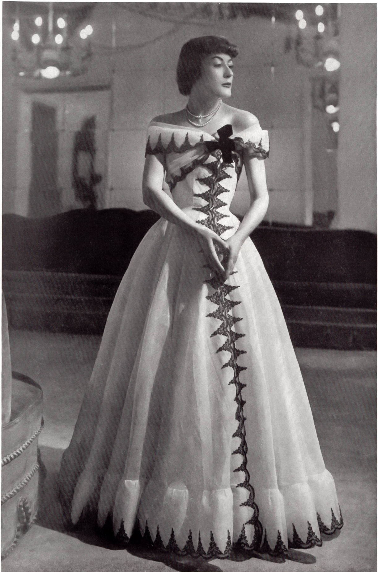
ROBERT PIGUET Union S.A., St-Gall PIERRE BRIVET FILS, PARIS