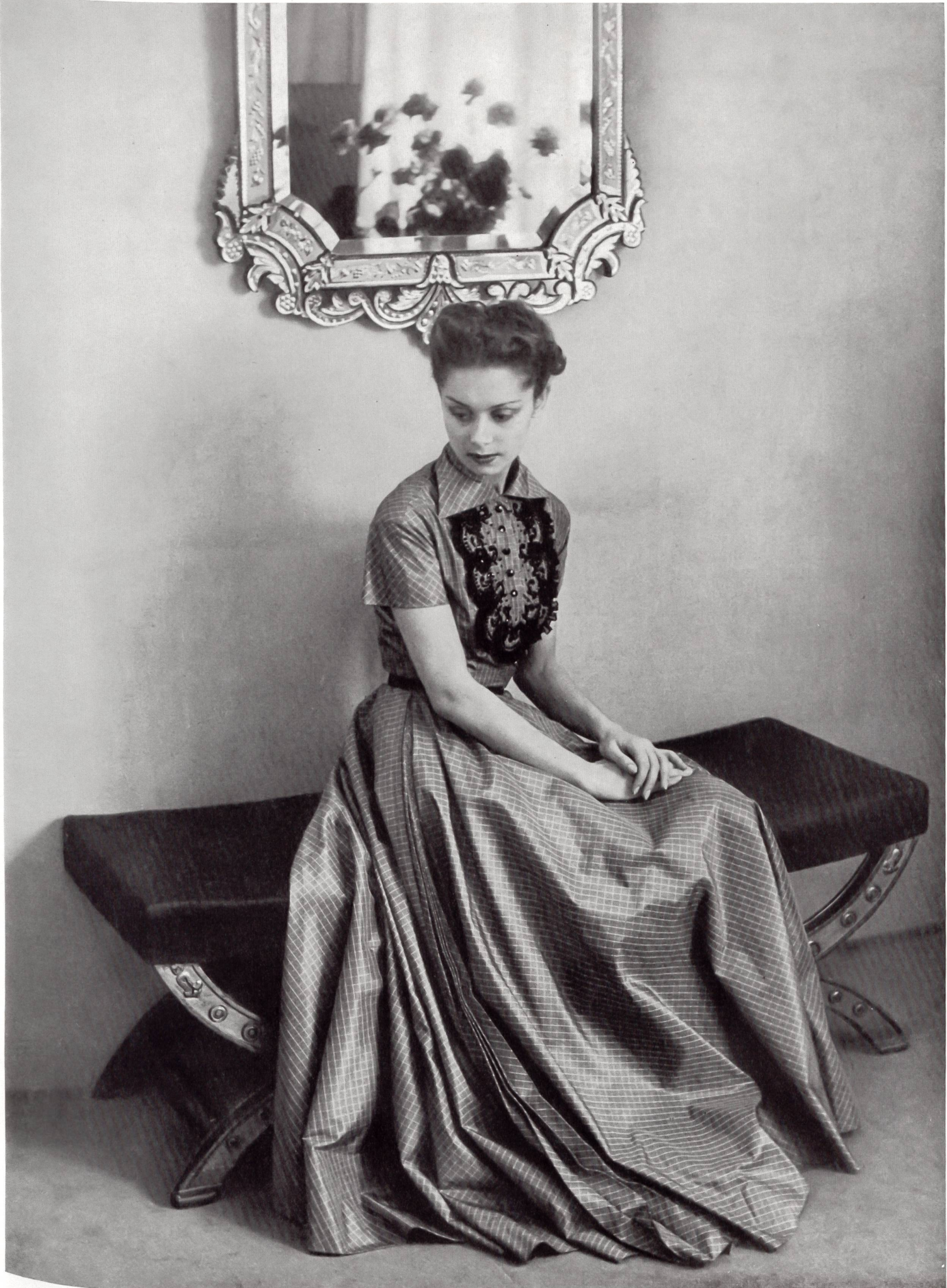
PIERRE BALMAIN L. Abraham & Cie, Soieries S.A., Zurich