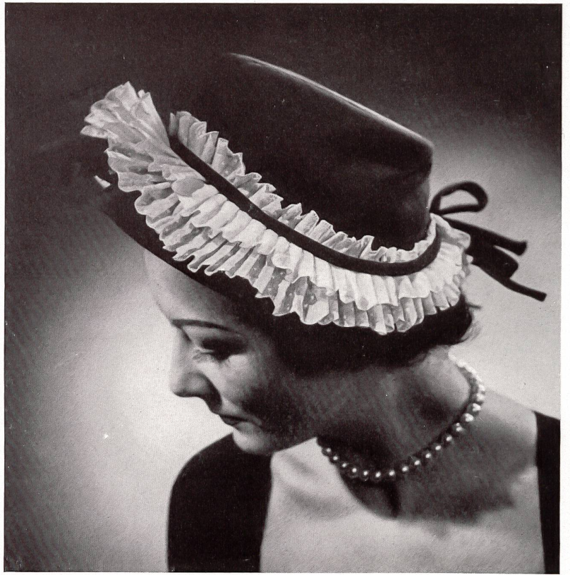
LEGROUX SŒURS A. Næf & Cie, Flawil INAMO, ZURICH