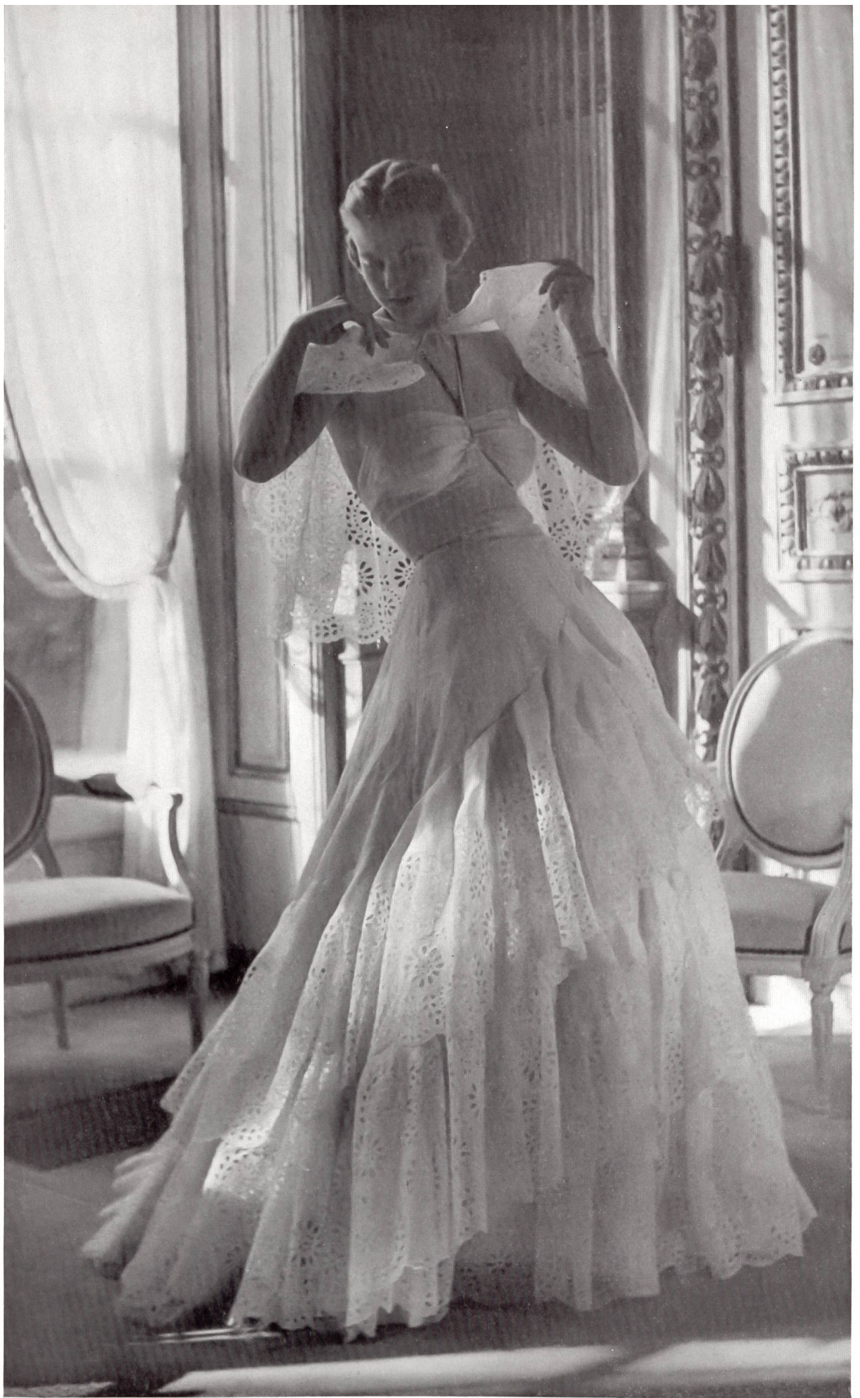
MAGGY ROUFF Hufenus & Cie, St-Gall THIÉBAUT-ADAM, PARIS