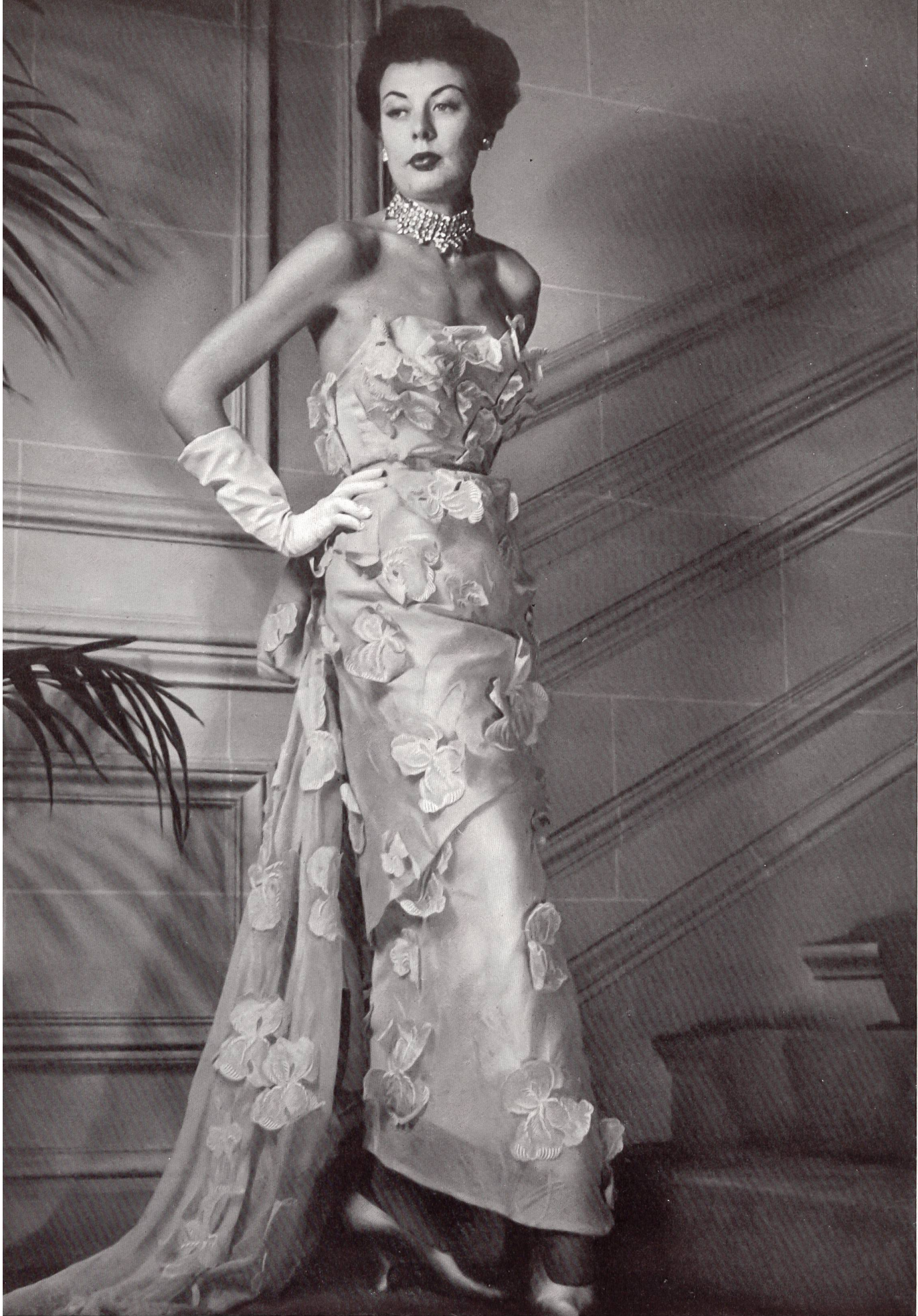
CHRISTIAN DIOR Forster Willi & Cie, St-Gall INAMO, ZURICH