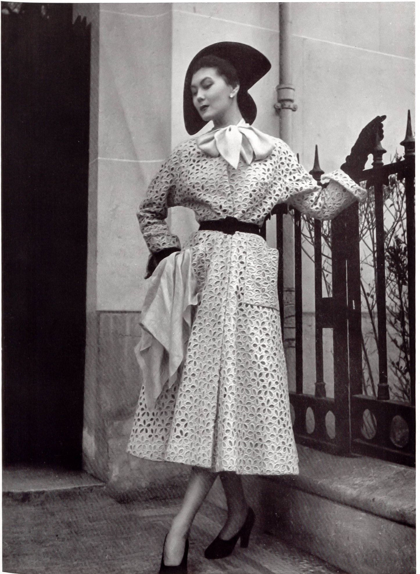
CHRISTIAN DIOR Forster Willi & Cie, St-Gall INAMO, ZURICH