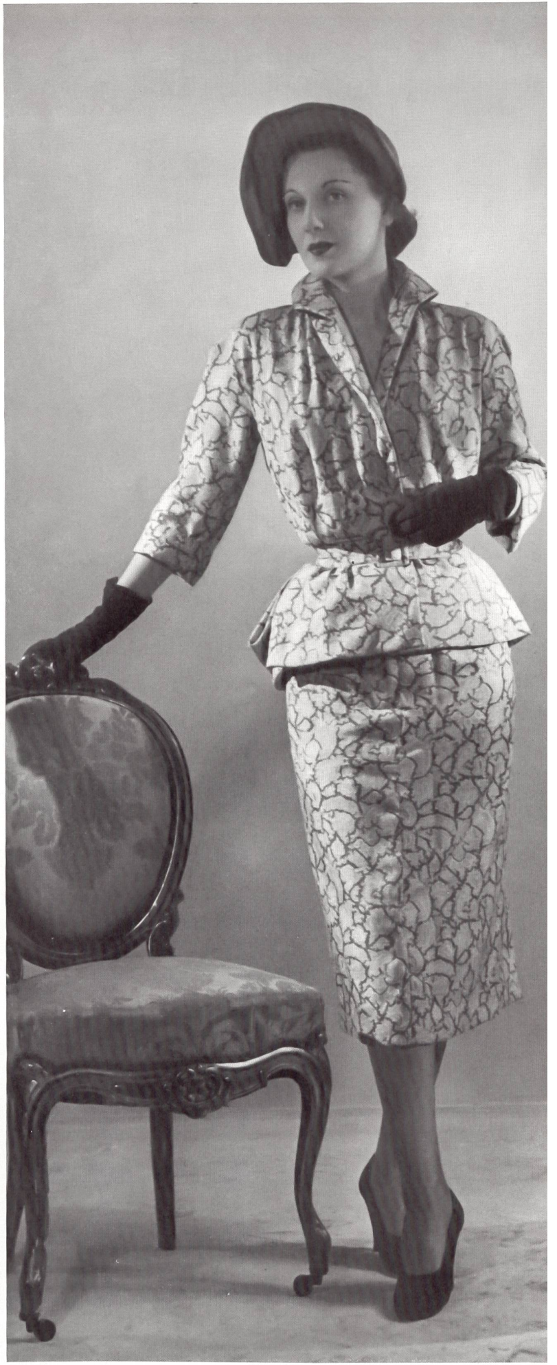
JACQUES GRIFFE L. Abraham & Cie, Soieries S.A., Zurich