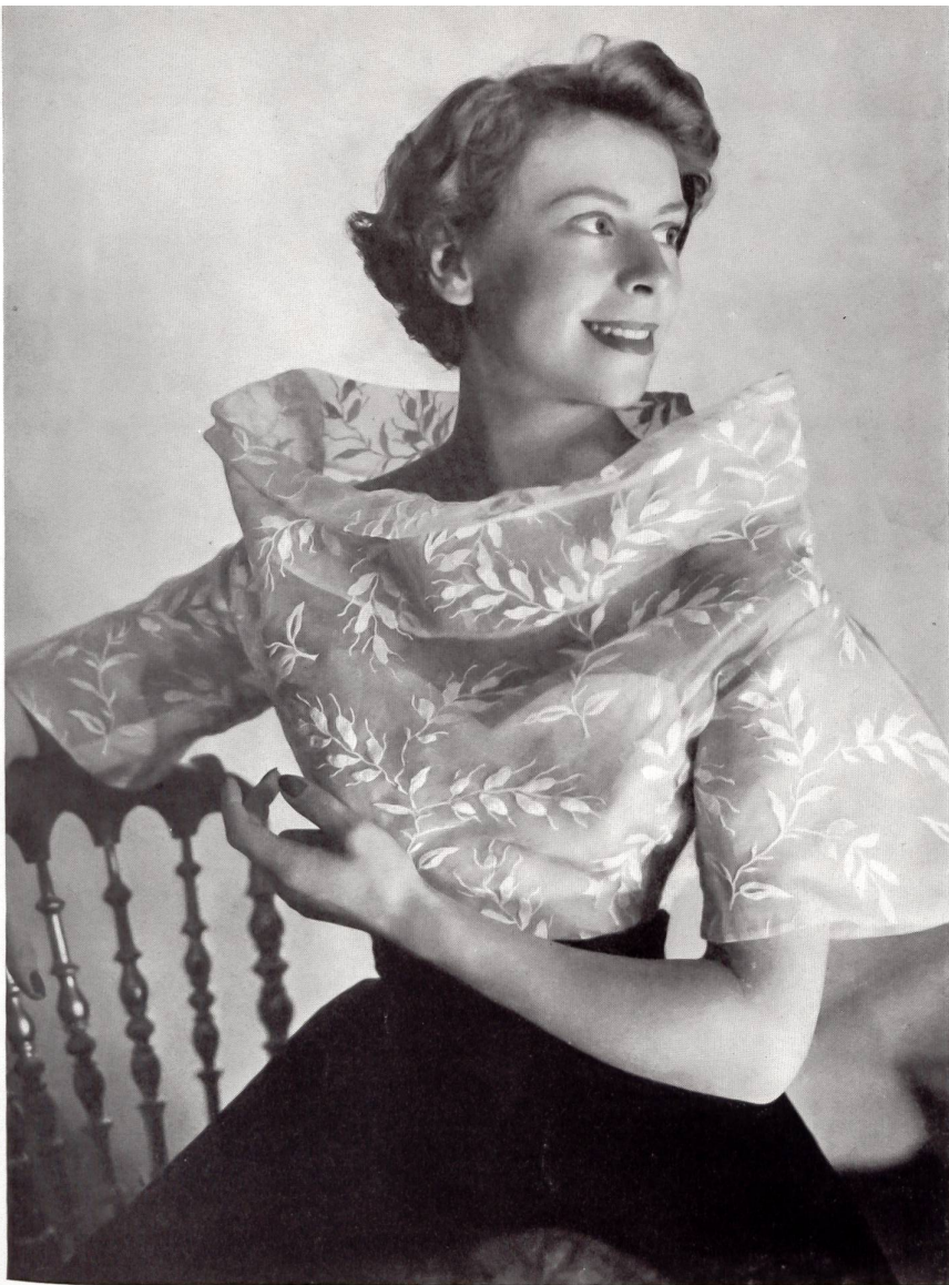
SCHIAPARELLI Aug. Giger & Cie, St-Gall PIERRE BRIVET FILS, PARIS