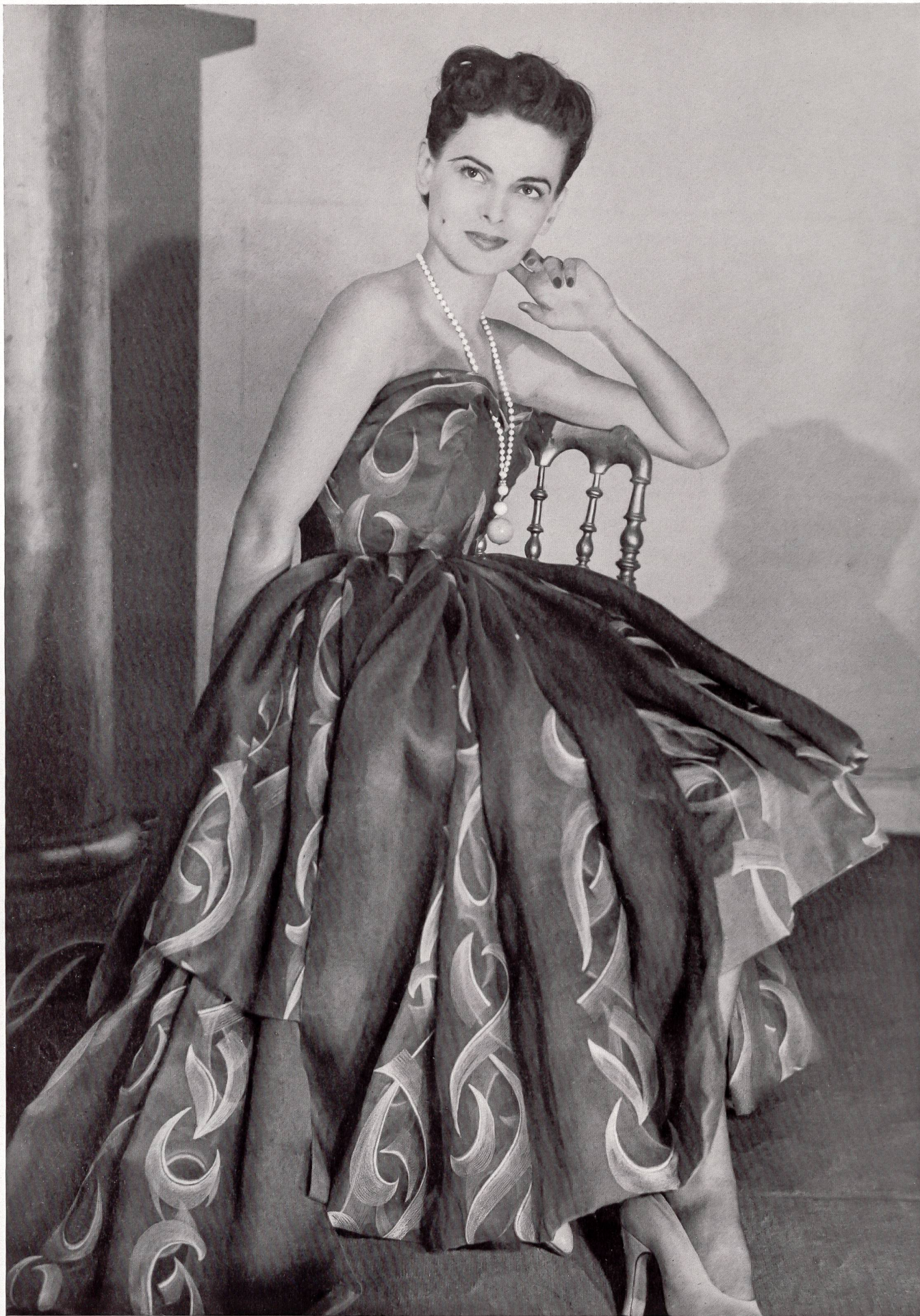
SCHIAPARELLI Forster Willi & Cie, St-Gall INAMO, ZURICH