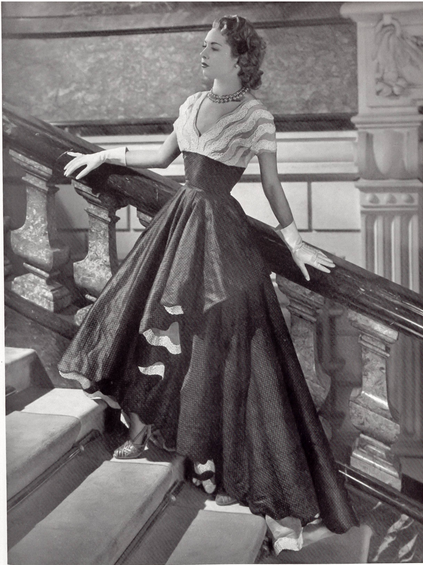
JEAN DESSÈS A. Nœf & Cie, Flawil THIÉBAUT-ADAM, PARIS