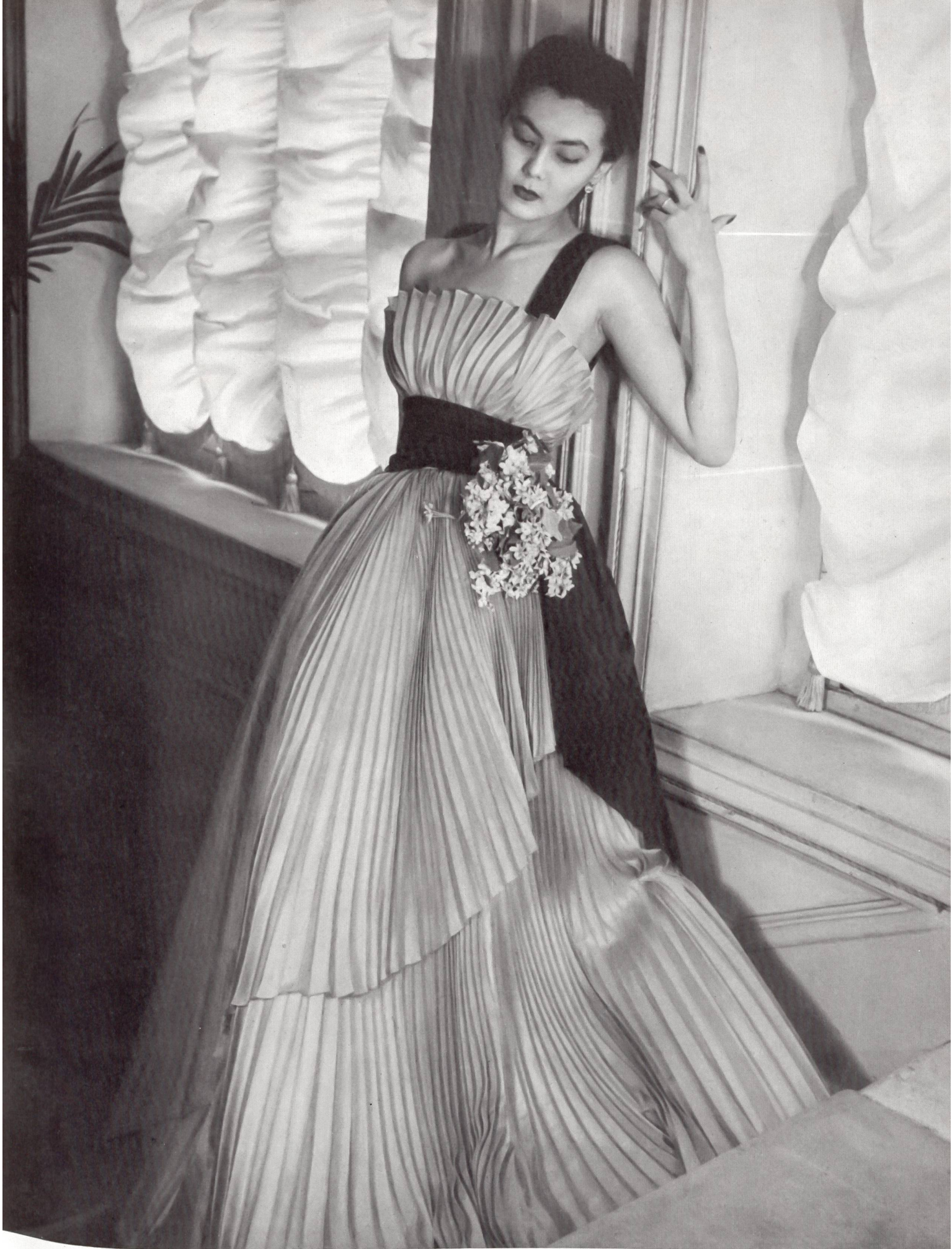
CHRISTIAN DIOR Emar S.A., Zurich INAMO, ZURICH