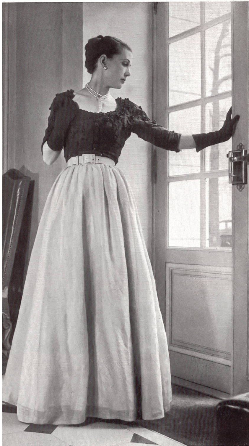
BALENCIAGA Heer & Cie S. A., Thalwil INAMO, ZURICH