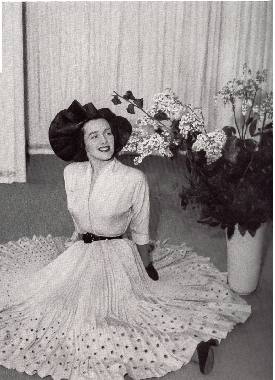
MARCEL ROCHAS Rudolf Brauchbar & Cie, Zurich