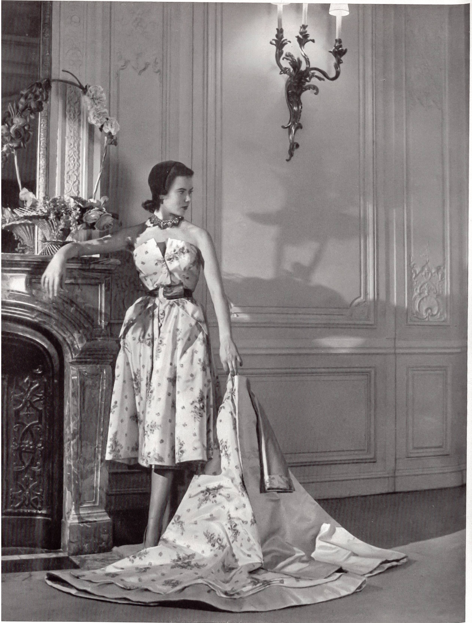
CHRISTIAN DIOR L. Abraham & Cie, Soieries S. A., Zurich