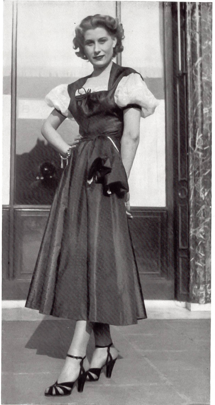
AGNÈS DRECOLL Rudolf Brauchbar & Cie, Zurich