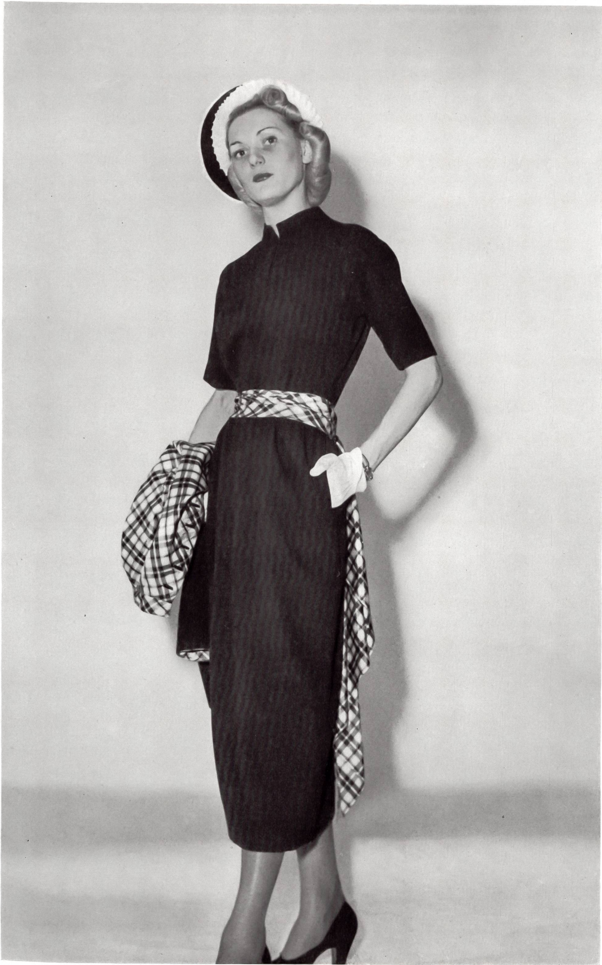
MOLYNEUX Rudolf Brauchbar & Cie, Zurich