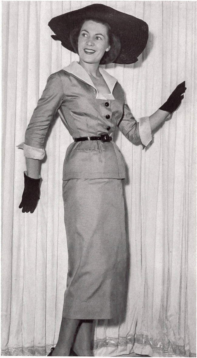
MARCEL ROCHAS Rudolf Brauchbar & Cie, Zurich