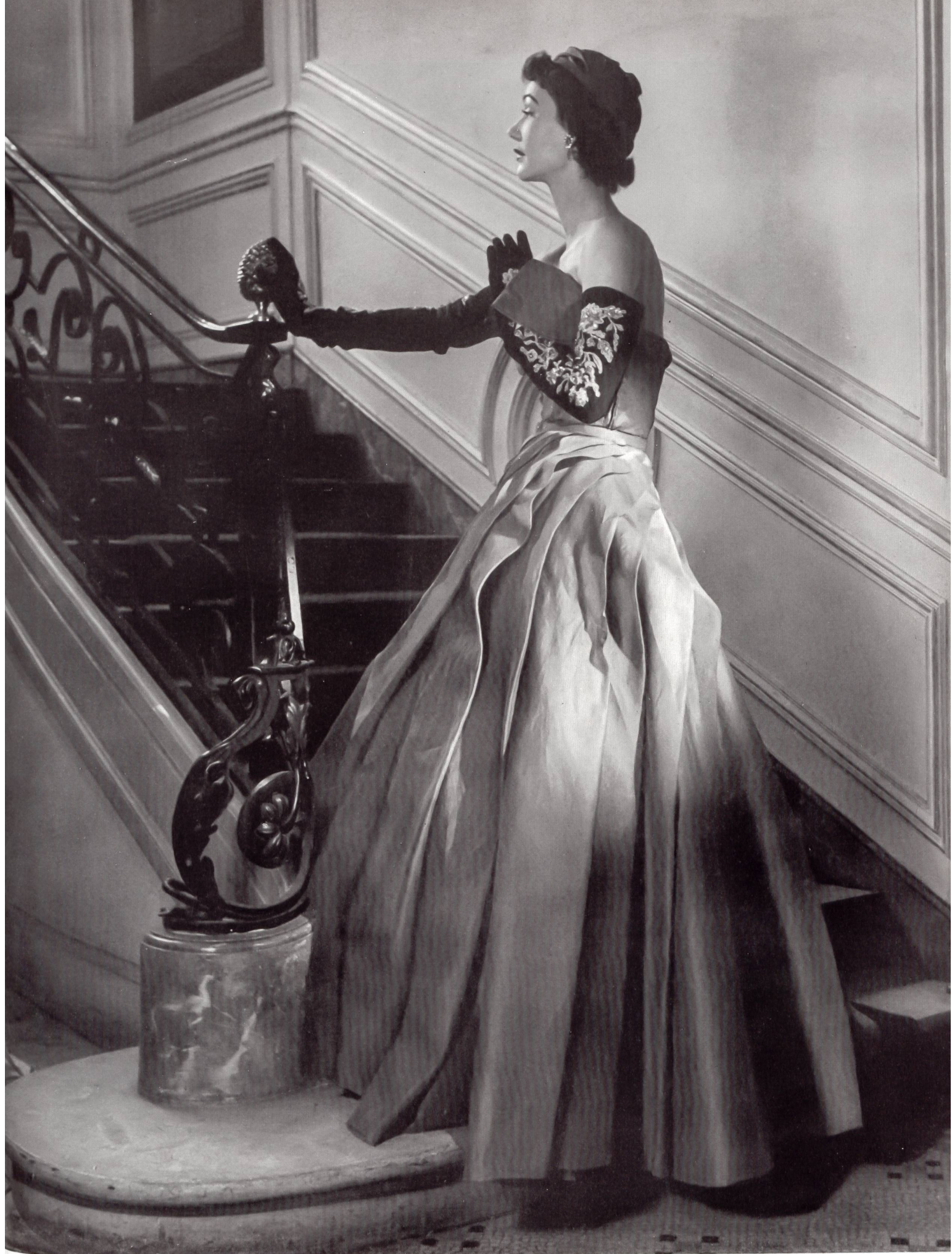
JACQUES FATH L. Abraham & Cie, Soieries S. A., Zurich