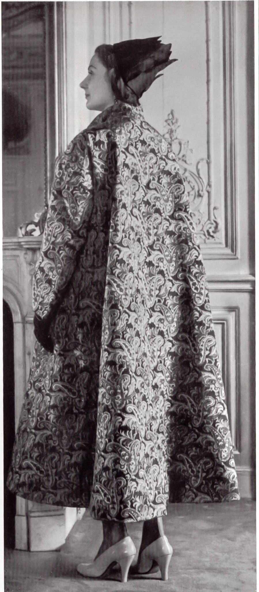
SCHIAPARELLI L. Abraham & Cie Soieries S. A., Zurich