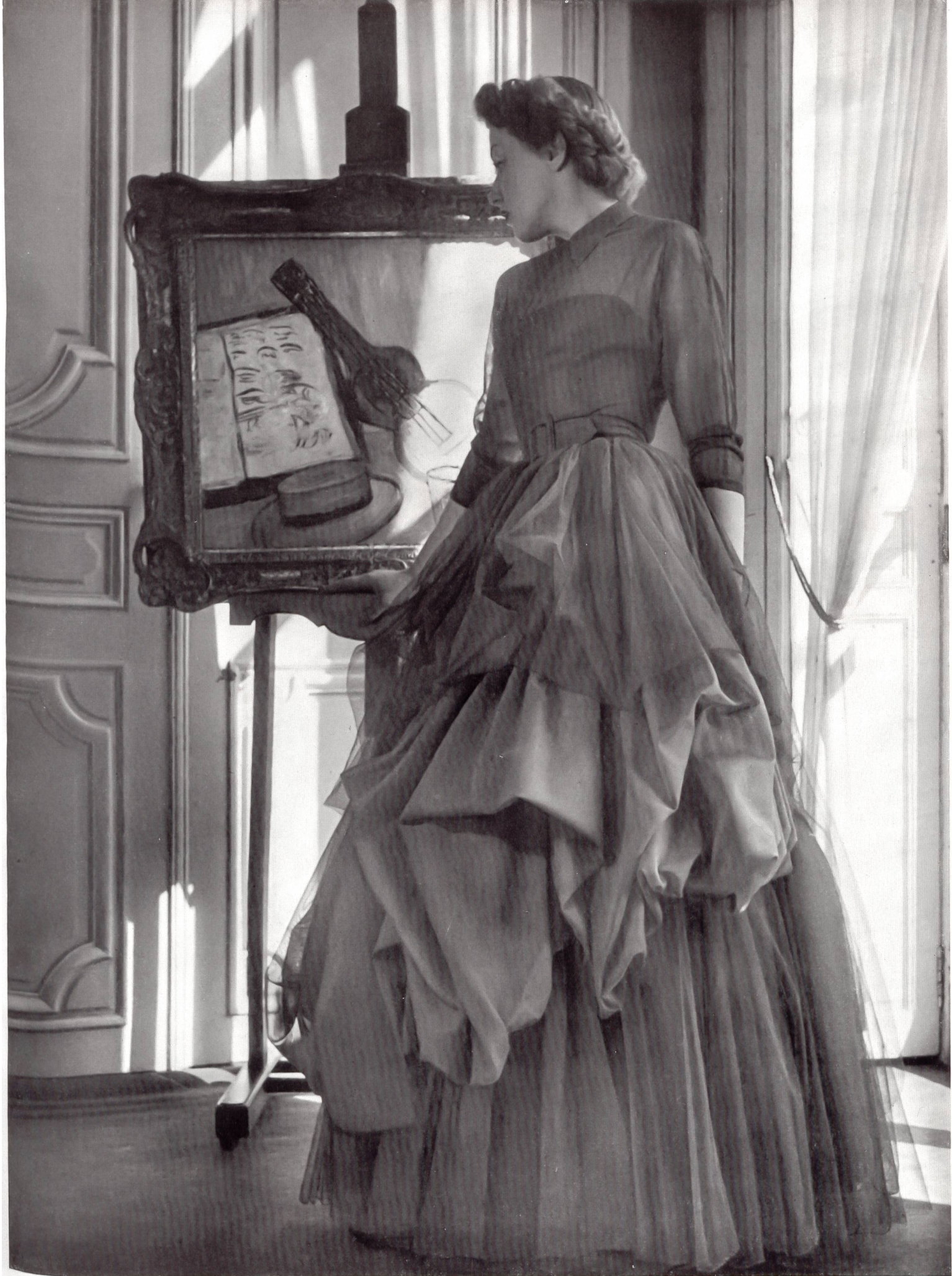
RAPHAEL Heer & Cie S. A., Thalwil INAMO, ZURICH