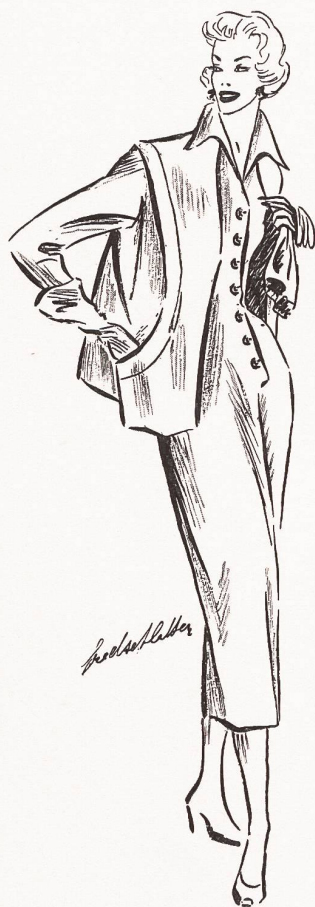
Suit in Swiss fabric by the « Galeria Carioca de Modas ».

While at this moment all the countries in the hemisphere of good taste are, and have been for quite a long time, enjoying the new finds of fashion, we are the reluctant laggards who can only look forward to these joys six months later. In the autumn, when Paris flings to the world its new ideas, its delightfully tempting outfits and fabulous coats, our minds, with the returning of the warm days, are busily occupied with the search for beachwear and cool and comfortable garments. When, in its turn, our autumn approaches, the silhouettes which come to us from the North show us how unimaginative we have been, and make us regret to see