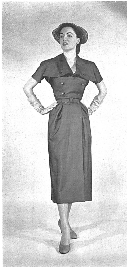
CHRISTIAN DIOR, NEW YORK Plain Amadis.