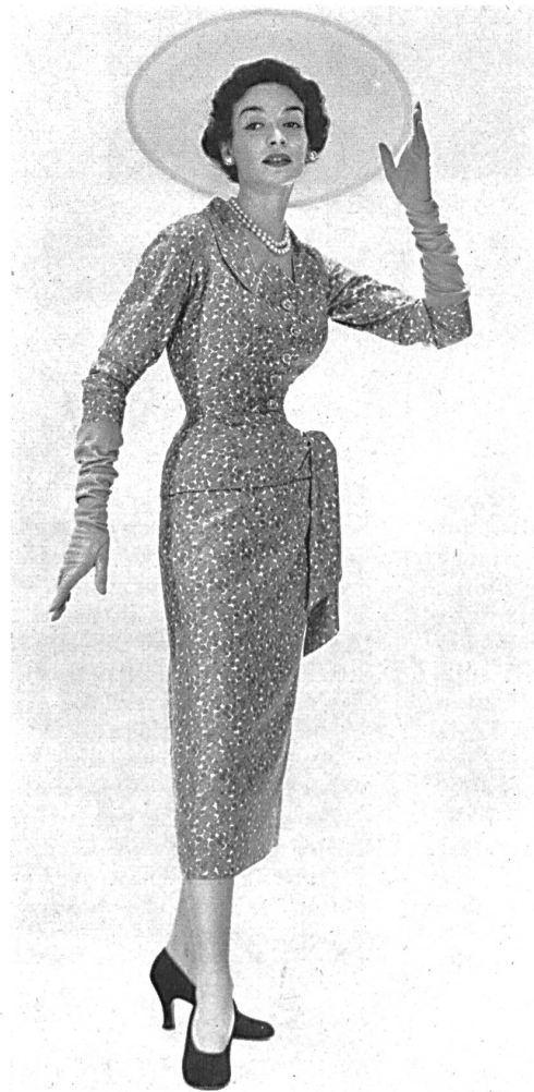
ELIZABETH ARDEN, NEW YORK Printed Atout.

All fabrics are from L. Abraham & Cie, Soieries S.A., Zurich