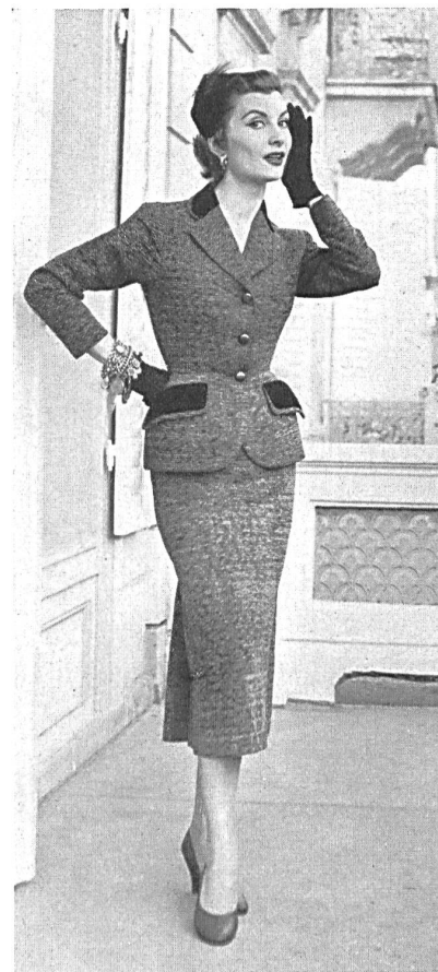
NICOL MODELLER A.-B., GÖTEBORG Chenilles fantaisie de Rudolf Brauchbar & Cie, Zurich.

whether they be ready-to-wear garments, knitwear, embroidery or silk and cotton fabrics. As a result of the measures of liberalisation undertaken by Sweden in answer to the recommendations of the Organisation for European Economic Cooperation, Swiss exports of textiles to Sweden have been favourable.