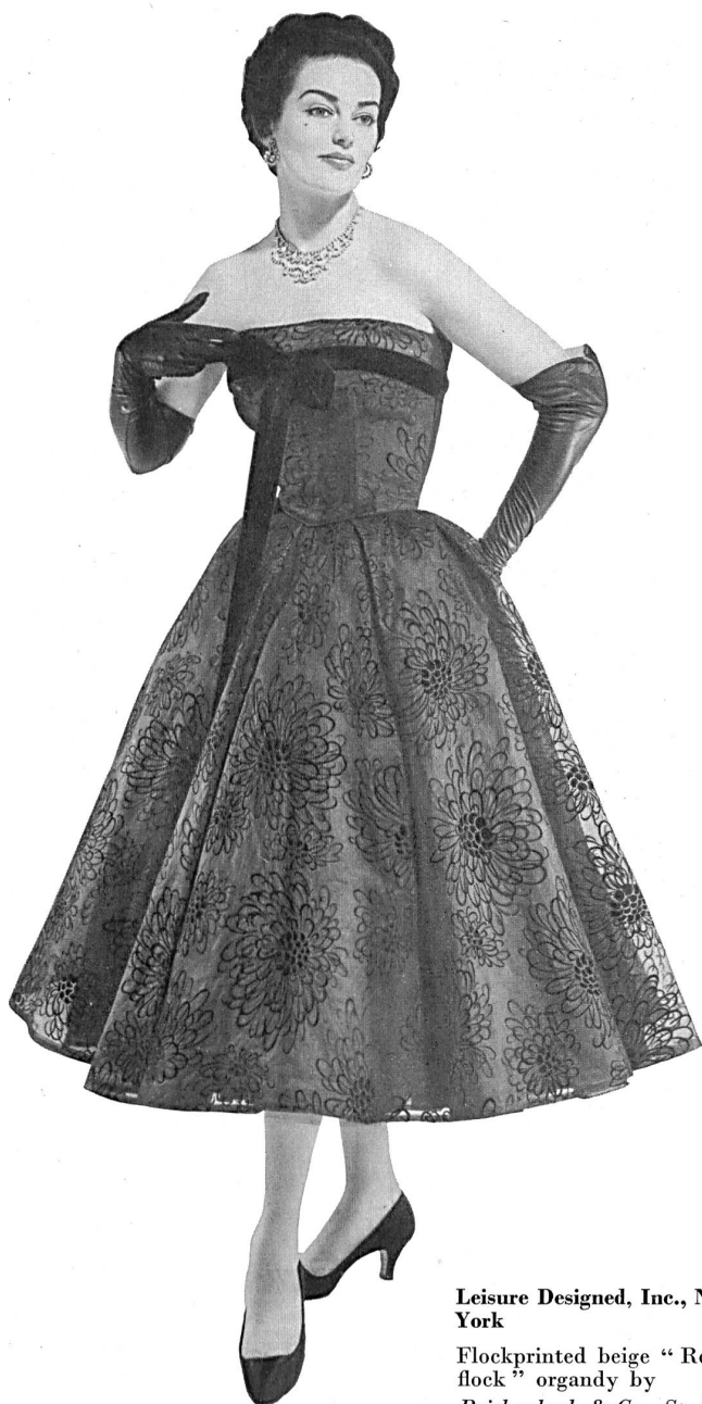
Leisure Designed, Inc., New York

Flockprinted beige "Reco-flock" organdy by Reichenbach & Co., St. Gall