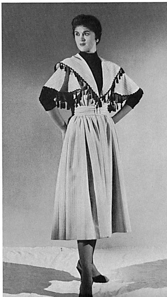
Spun rayon coat dress. «Zürrer» fabric by Weisbrod Zuerrer Fils, Hausen s.A.

The sisters then opened a retail shop to find out what the public wanted. They concluded after an extremely successful year in business that women, en masse, have little taste, but on the other hand, they know what they want and if given good clothes they will buy them. With the encouragement of a fine specialty shop buyer, they entered into the wholesale end of their business a year ago. They decorated their salon in a charming and feminine manner, they serve tea and coffee on the