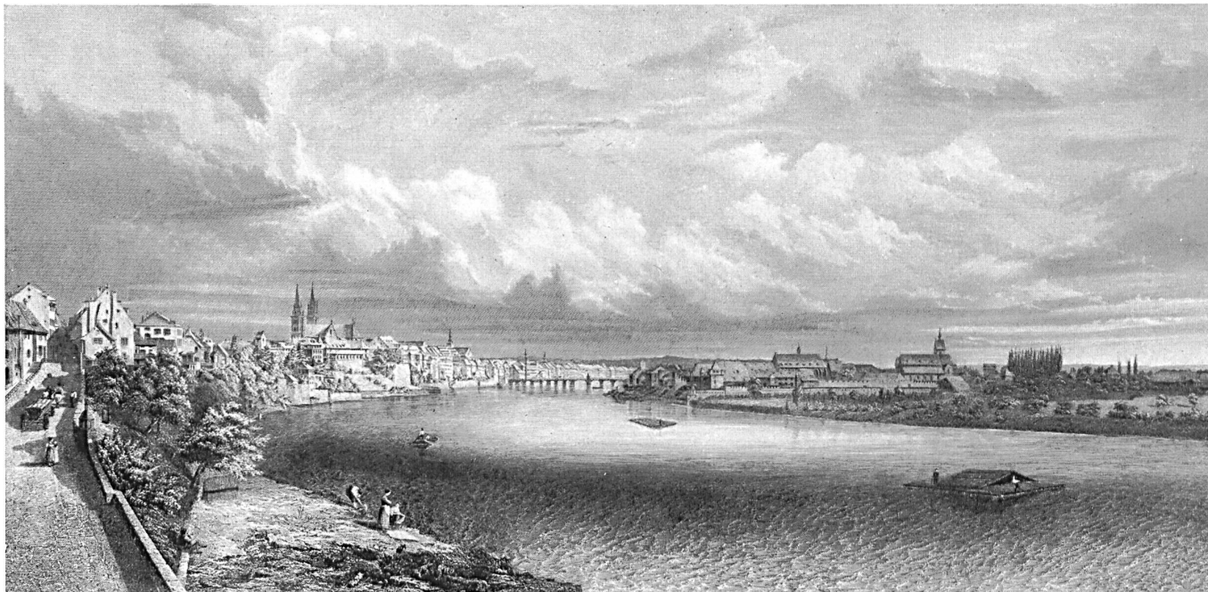
Basle, a century ago (from a contemporary engraving).