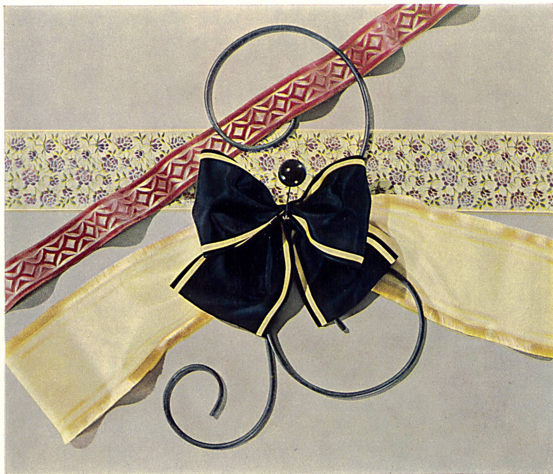
Modern Basle ribbons in various styles.