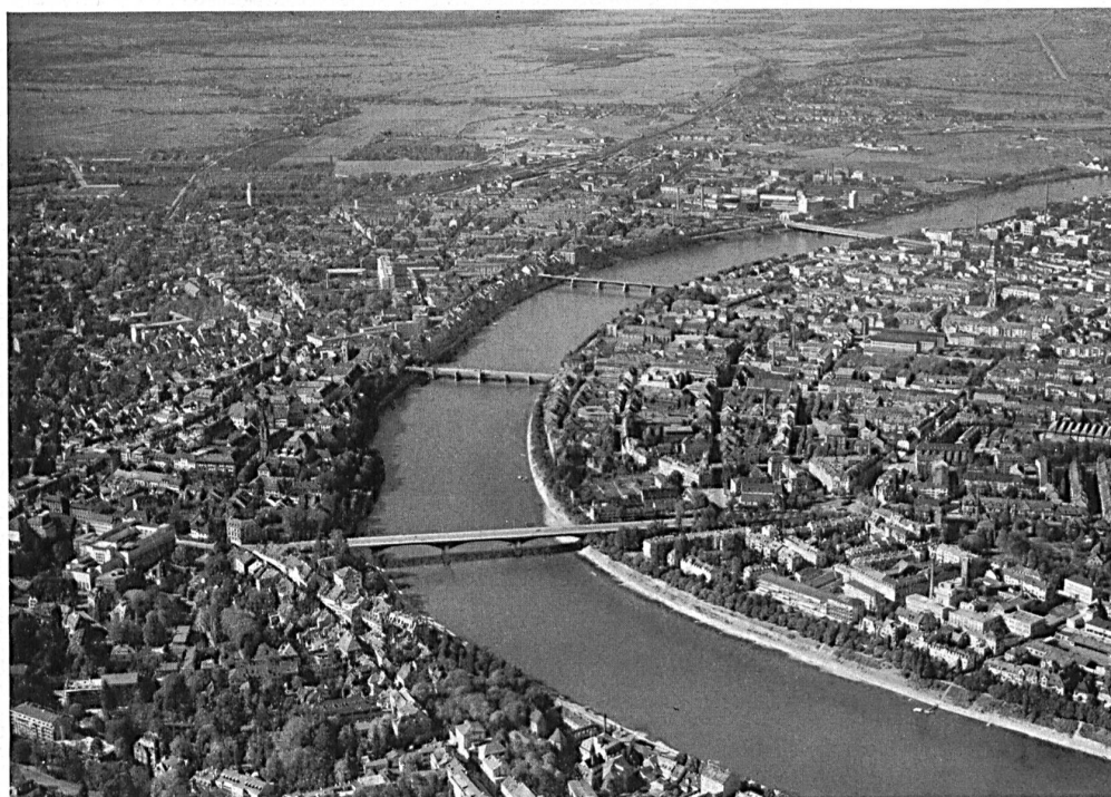
Aerial view of Basle. On the left along the river between the first two bridges, lies the old city.