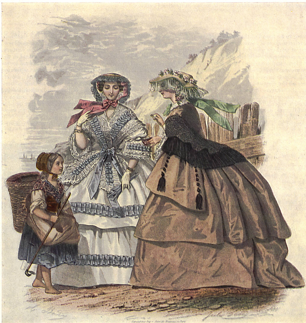
The ribbon in feminine fashion a century ago (from contemporary engravings).

Space does not permit us to go here into the details of the industrial structure of this branch. The introduction of looms driven independently by individual motors made decentralization possible: the present trend is towards the establishment of small decentralized factories, run on very rational lines, with modern machinery and skilled workers. Manufacture is almost entirely concentrated in the cantons of Basle-Country and Aargau, but all the big firms have their offices in Basle.