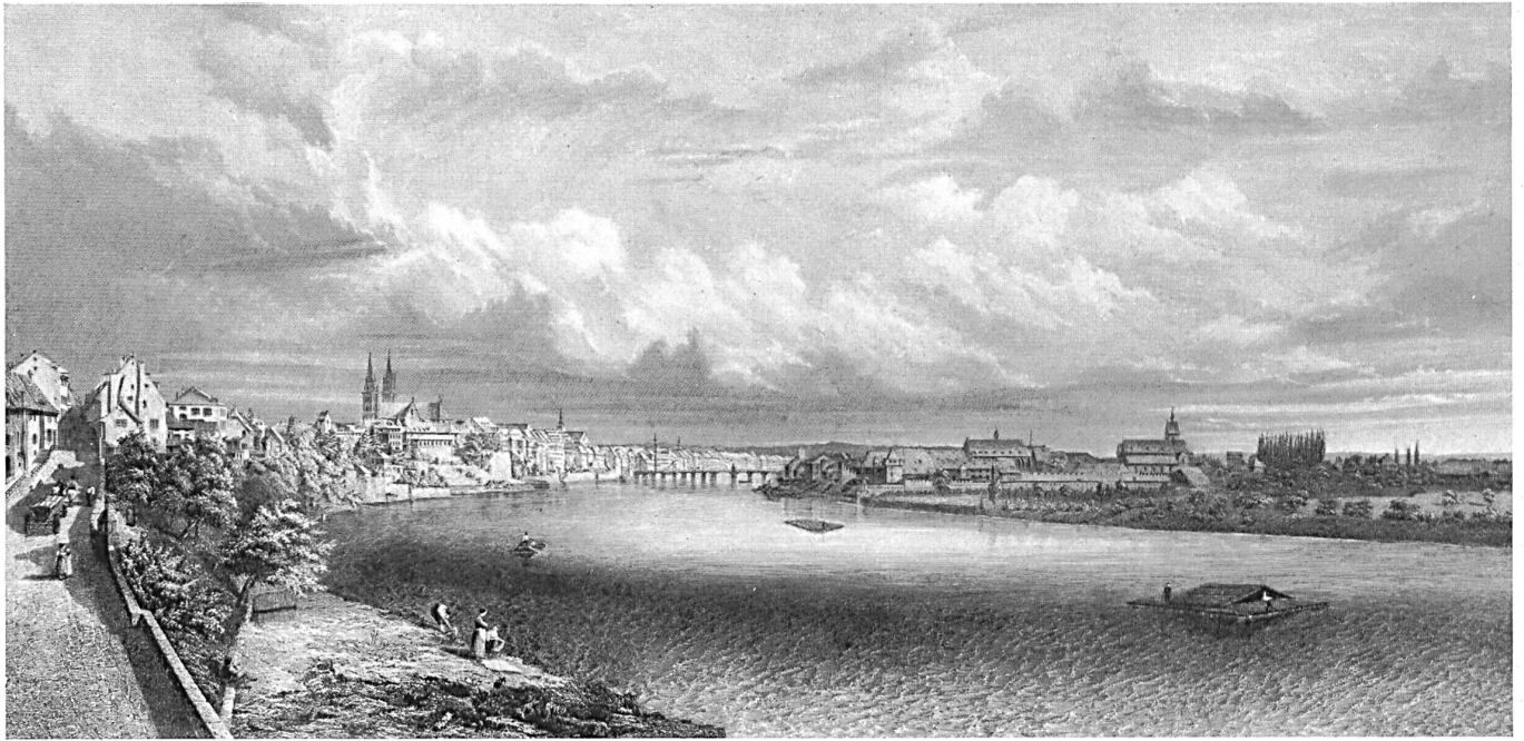
Basle, a century ago (from a contemporary engraving).