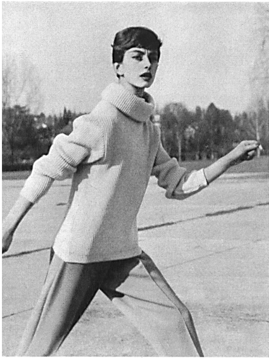
Beige after ski trousers and ivory coloured sweater.