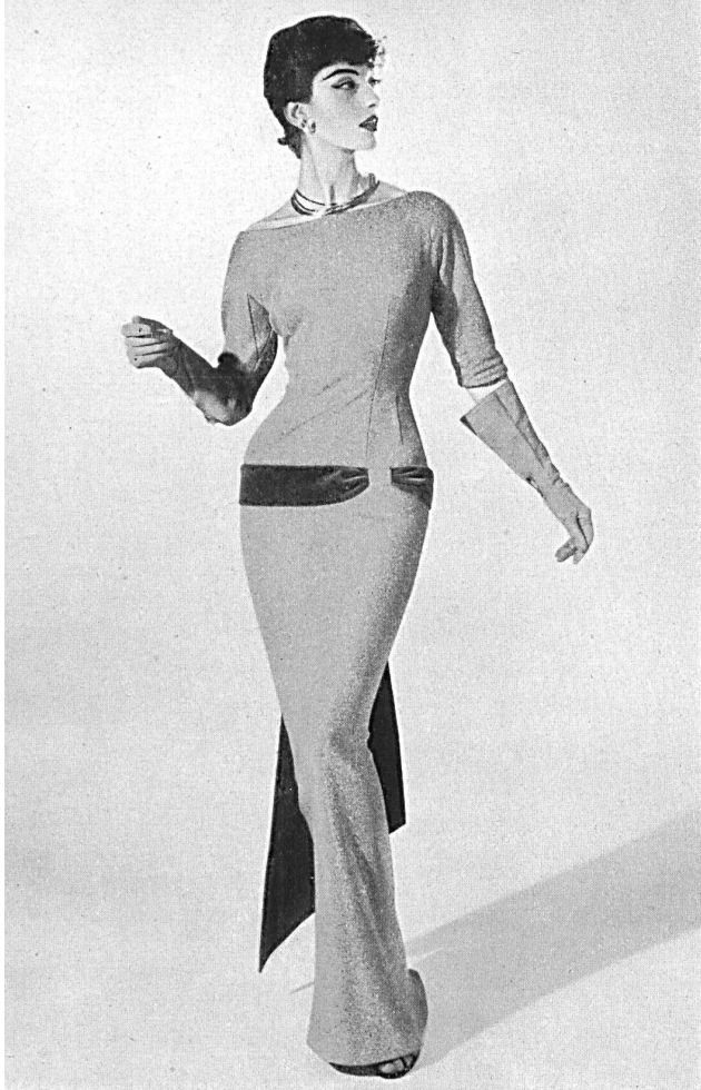
Grey metallic jersey evening gown.