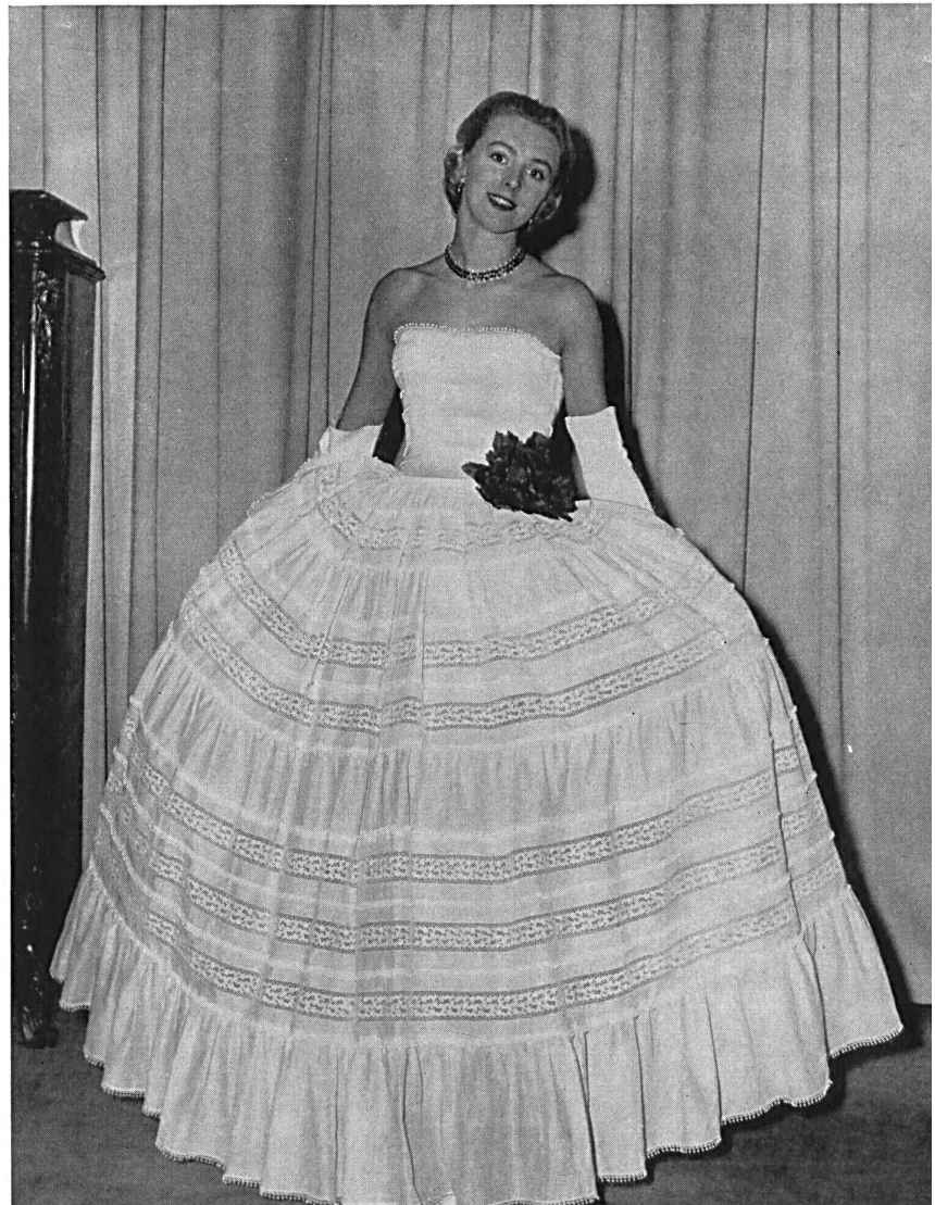
REICHENBACH & Co., SAINT-GALL White embroidered batiste Model by : Christian Dior Ltd., London

Bond Street, which makes its way narrowly from Oxford Street to Piccadilly, was at one time famed as the most fashionable thoroughfare in Europe and maybe of the world ; and even today it still retains much of its dignity.