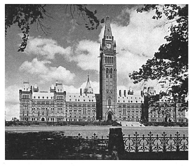
Ottawa-Centre block of Canada's Parliament Buildings with the Peace Tower.

and Swiss merchandise is high on their list of this type of goods. «Our customers », says Mr. Morgan, «like this merchandise as it is different from the usual Canadian and U. S. products which make up the bulk of our stocks. They like Swiss goods for their quality and their design. Over fifty per cent of all the men's ties we sell are made from Swiss fabrics. Our parent firm in Montreal sends