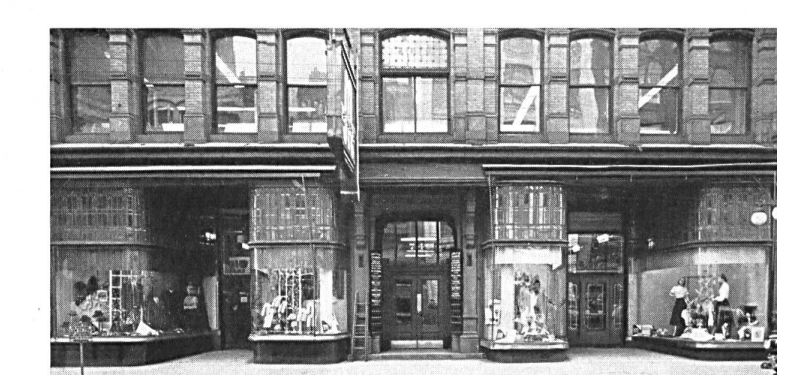
Morgan's Ottawa store, in Spark Street.