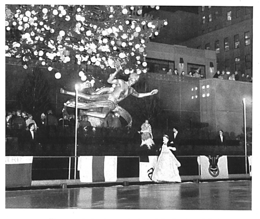
The open air showing, at the foot of the illuminated Christmas tree, in front of the ice-rink at the Rockefeller Center.

Switzerland is well known in the United States for her cheese, chocolate, watches, beautiful scenery and good hotels. With regard to textiles, certain specialities are already quite well known but, for one reason or another, her women's ready-to-wear clothing does not enjoy the same renown. That is why the Swiss Travel Office in New York had the idea of showing Americans a different side of Switzerland for a change, taking advantage of the winter season to give this fashion show a slightly touristic flavour. The Exporters Association of the Swiss Clothing Industry leapt at the idea and feverishly set to work even though it was a well-nigh impossible task to hope to put on in three short weeks a show intended to attract and startle the sophisticated people of New York, who were all very busy doing their last-minute Christmas shopping in an unprecedented spending spree. The task was made even more difficult by the fact that it was necessary to try and capture the attention of the fashion reporters who are notoriously even more blasé than the general run of the population. The culminating difficulty was the fact that the organisers had decided to hold the show at the ice-rink of the