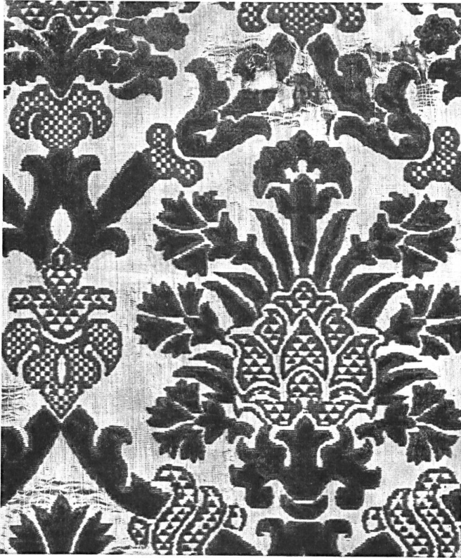
Velours de soie italien rouge foncé, XVI e siècle. Italian dark red silk velvet, 16th century. Terciopelo de seda italiano, rojo oscuro; siglo XVI. Dunkelroter Seidensamt, Italien 16. Jahrh.