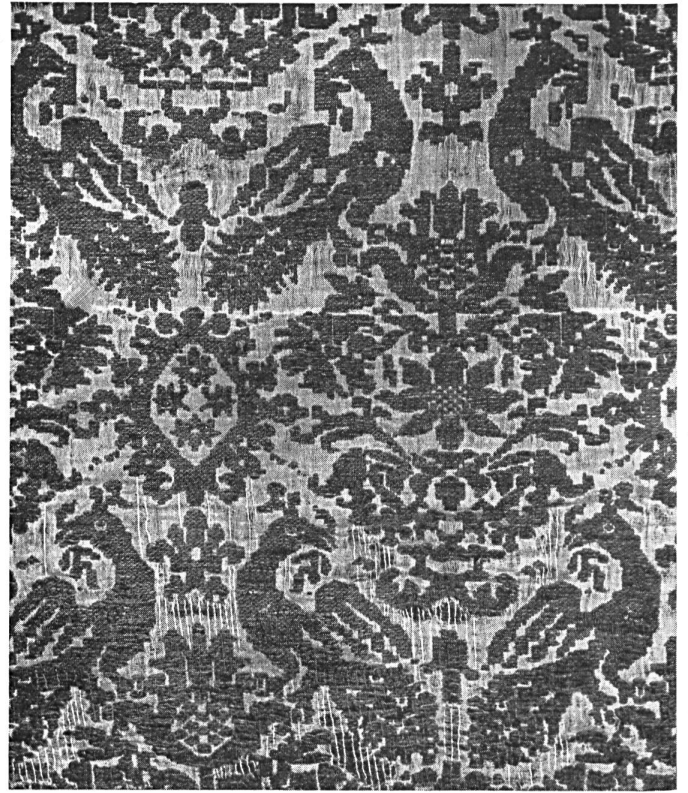
Tissu double italien : taffetas de soie jaune avec coton bleu, XVII e siècle. Italian double fabric : yellow silk taffeta and blue cotton, 17th century. Tejido italiano doble : Tafetán de seda con algodón azul; siglo XVII. Doppelgewebe, gelber Seidentaffet mit blauer Baumwolle, Italien, 17. Jahrh.