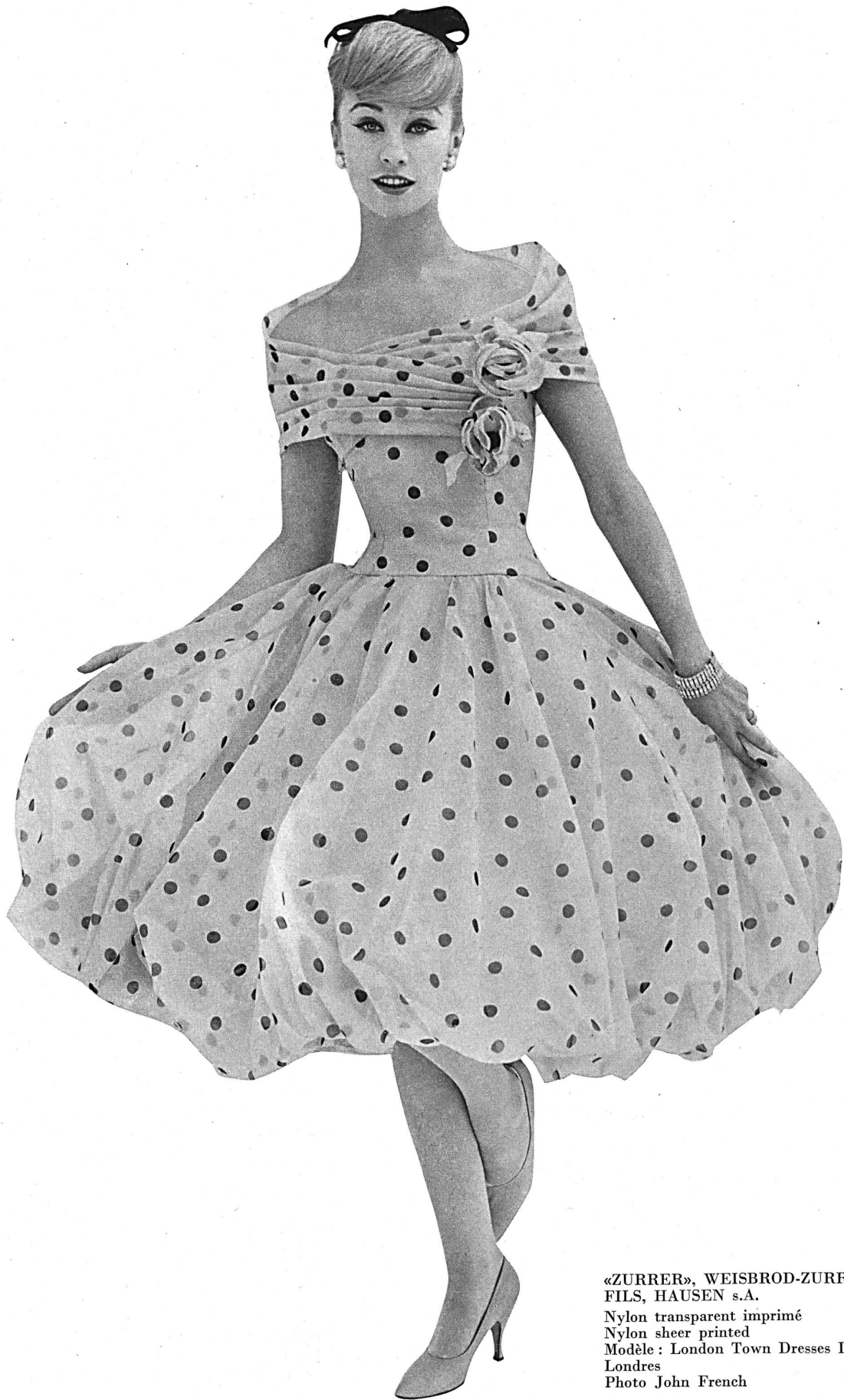
«ZURRER», WEISBROD-ZURRER FILS, HAUSEN s.A. Nylon transparent imprimé Nylon sheer printed Modèle : London Town Dresses Ltd., Londres