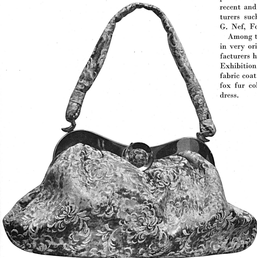
METTLER & CIE S.A., SAINT-GALL Brocart de coton Baumwollbrokat Modèle: Fritz Fürstl, Offenbach s.M.

Among the fabrics were cotton jacquards and brocades in very original designs and colours, which Swiss manufacturers had created specially for the Brussels Universal Exhibition. The loveliest model of all was a brocaded fabric coat with an Inca motif, trimmed with a big white fox fur collar and worn over a gold-spangled chemise dress.