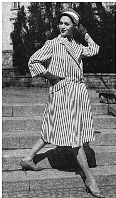
Élégant ensemble d'après-midi en satin de coton. Smart afternoon ensemble in cotton satin. Elegante traje de tarde de satén de algodón. Elegantes Nachmittagsensemble aus Baumwollsatın.