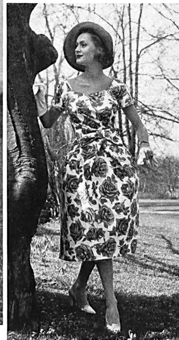
Robe de cocktail en piqué imprimé main. Hand printed piqué cocktail dress. Vestido de coctel de piqué estampado a mano. Cocktailkleid aus Baumwollpiqué mit Handdruck.