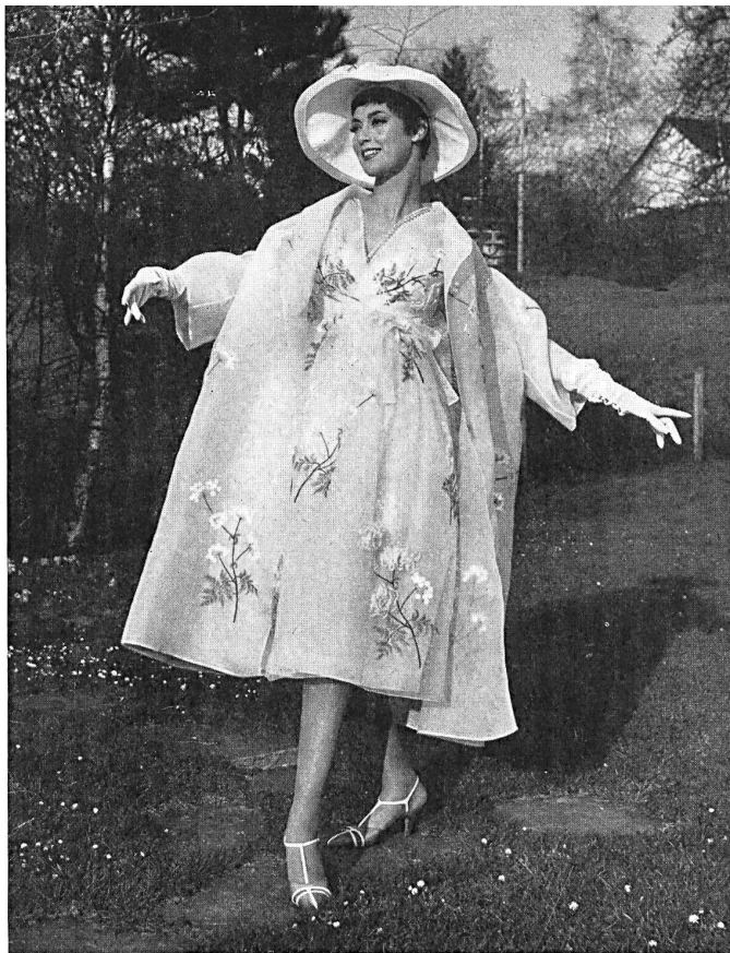
Ensemble de cocktail en organdi brodé. Embroidered organdy two-piece cocktail ensemble. Traje de dos piezas para coctel de organdi bordado. Cocktail Ensemble aus besticktem Organdy.

This showing was preceded on the same day by another parade held at Lenzburg Castle during a luncheon given for the press.