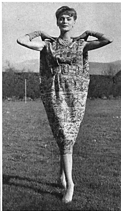
Robe d'après-midi en tissu jacquard lamé et imprimé. Afternoon dress in jacquard fabric, printed and with metallic threads. Vestido de tarde de tejido jacquard con estampación y efectos de hilos metálicos. Nachmittagskleid aus Jacquardgewebe mit Laméfäden und bedruckt.