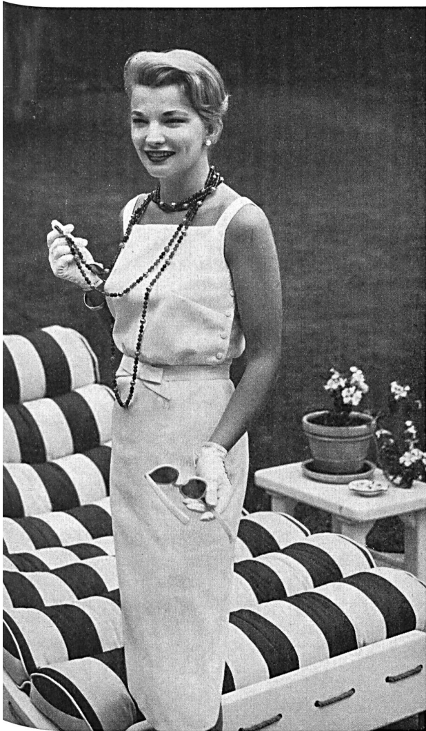
«NELO», J. G. NEF & Co. Ltd., HERISAU Nelo-Lugano cotton fabric. Model Lanz of California worn by MGM Star Gera Rowlands.