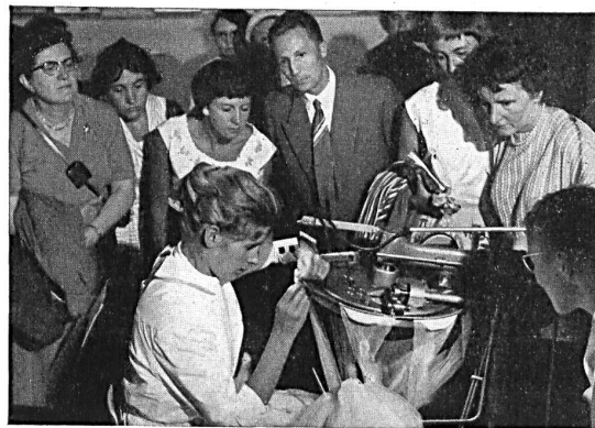
Société de la Viscose suisse, Emmenbrücke

At SAFFA, the Swiss Viscose Company was represented first of all by an information stand devoted to "Nylsuisse" nylon (registered trade mark) in the pavilion of the Zurich Institute of Household Research. It also had a display in the "Woman in Industry" hall, in the "Textile industry" group, organised by the Employers' Association of the Textile Industry. In addition to the numerous fabrics man made fibres displayed in the "Silk Tower" (see page 150, fig. 3), it had a stand giving the visitor information concerning the manufacture and use of all the firm's products: nylon, rayon and staple fibre yarns, artificial straw for braiding, artificial hair for wigs, etc.