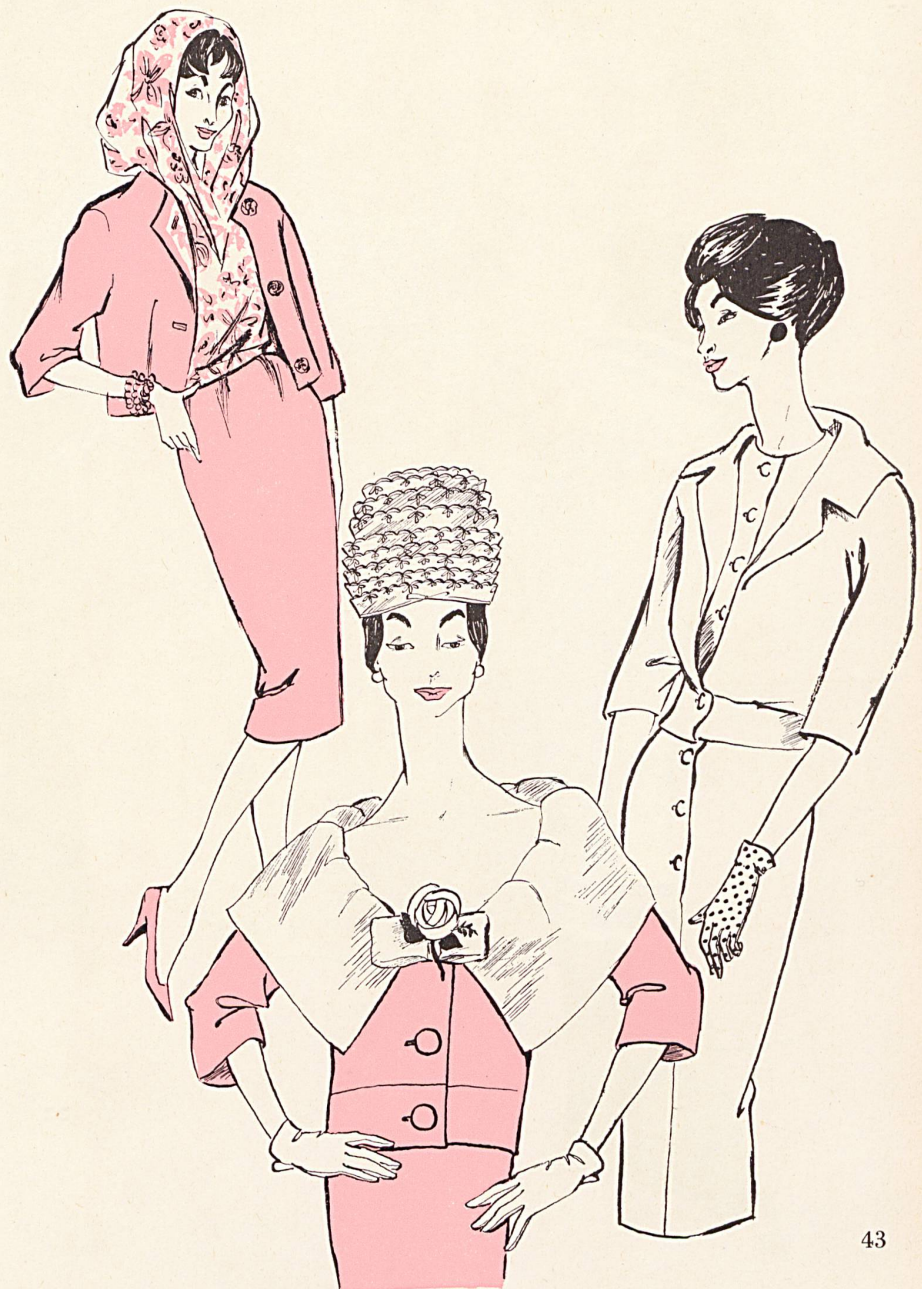
Left: GUY LAROCHE Centre: PIERRE CARDIN Right: JACQUES HEIM

All at once I feel rather inadequate for I suddenly realise that I have told you nothing of the technical side of the latest collections. Perhaps it is because, at this season, technique is hidden. It is there though, it is the framework, the backdrop on which the dazzling arabesques have been embroidered.